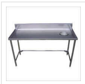
Stainless Steel Dish Landing Counter