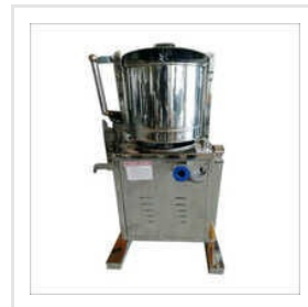
Stainless Steel Commercial Wet Grinder