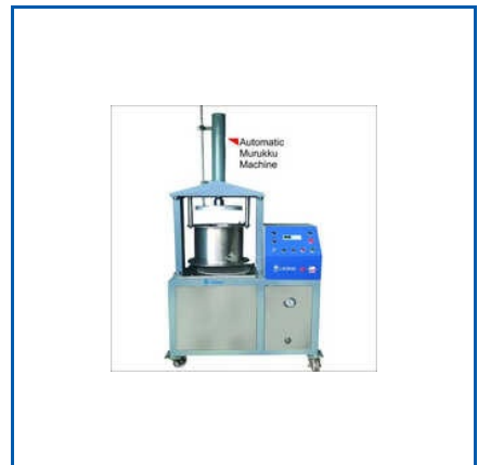
AUTOMATIC MURUKKU MAKING MACHINE