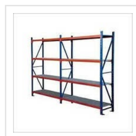
Mild Steel Storage Rack