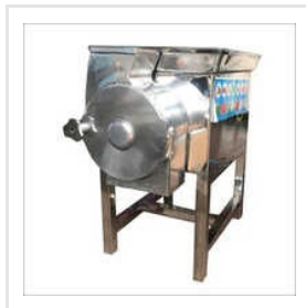
Semi Automatic Gravy Machine