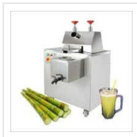
SS Big Sugarcane Juice Machine