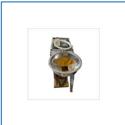
STAINLESS STEEL FOOD PULVERIZER

10-15 kg Tray Dryer Machine, 40Ltr Stainless Steel Water Cooler, Automatic Chapati Making Machine, Automatic Murukku Making Machine, Automatic SS Conveyor Chapati Machine, Commercial Stainless Steel Sink, Hand Operated Chilli Cutter Machine, Indoor Stone Table Top, Instant Wet Rice Grinder, Mild Steel Storage Rack, On Site Wet Grinder Repairing Service, SS Big Sugarcane Juice Machine, Semi Automatic Gravy Machine, Single Phase Gravy Machine, Six Burner Cooking Range, etc.