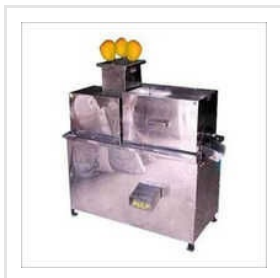
Stainless Steel Mango Juice Machine