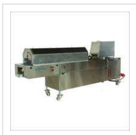
Automatic SS Conveyor Chapati Machine