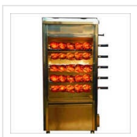
Stainless Steel Chicken Grill Machine