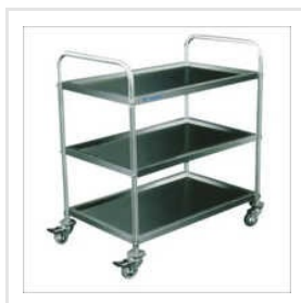
Stainless Steel Kitchen Trolley