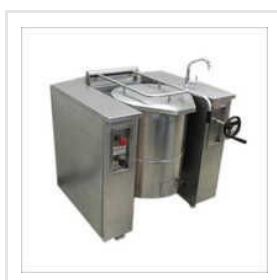
Stainless Steel Tilting Boiling Pan