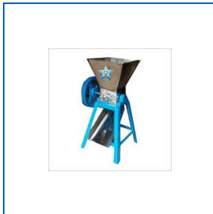
HAND OPERATED CHILLI CUTTER MACHINE