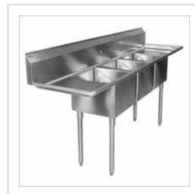
Commercial Stainless Steel Sink