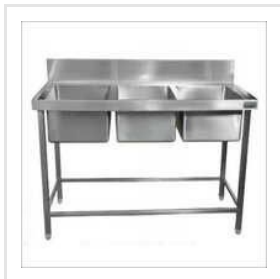
Stainless Steel Kitchen Sink