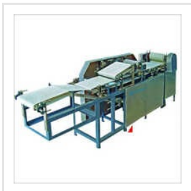
Automatic Chapati Making Machine