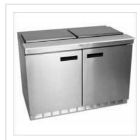
Stainless Steel Worktop Deep Freezer