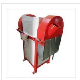
Single Phase Gravy Machine