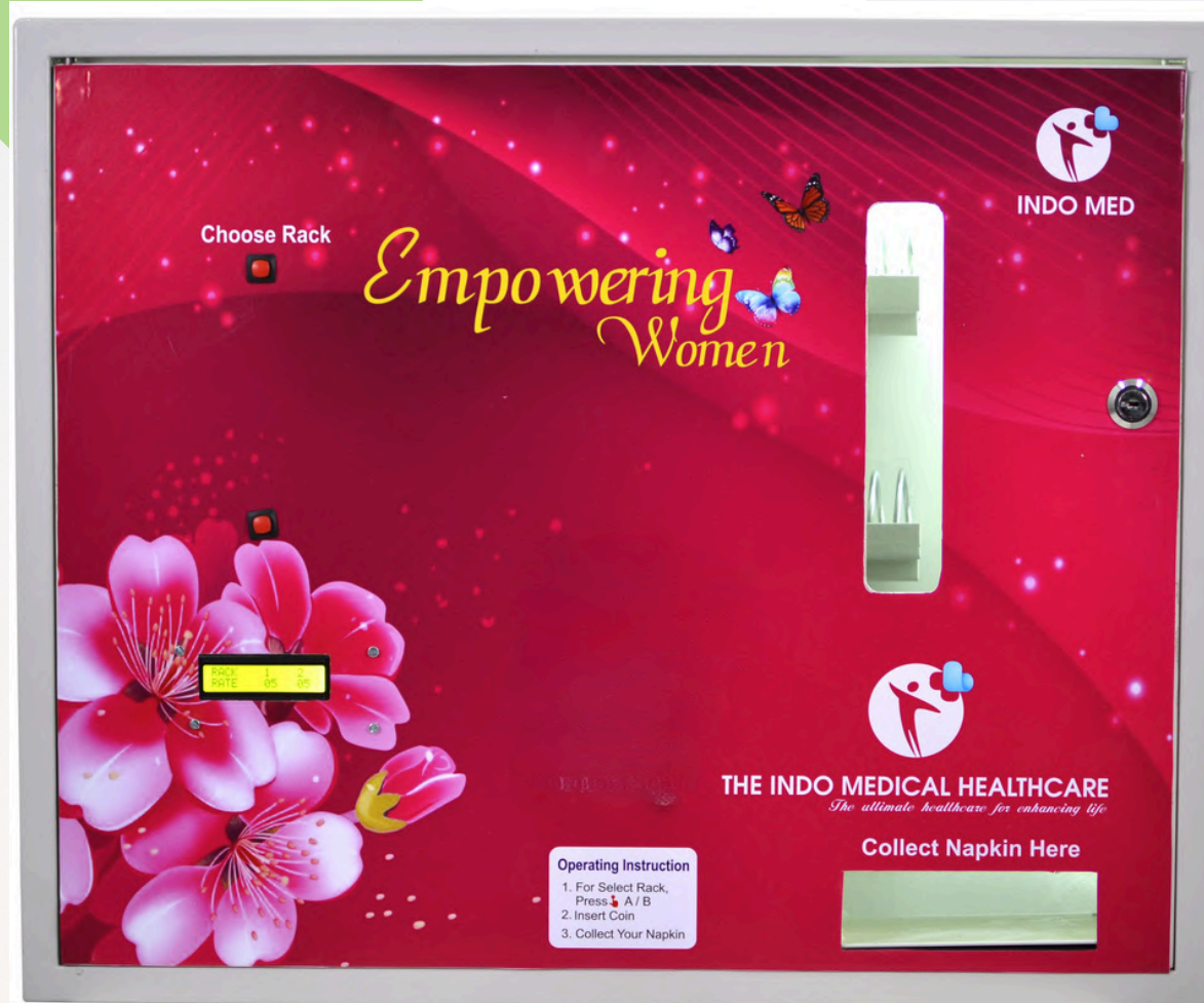
SANITARY NAPKIN VENDING MACHINE