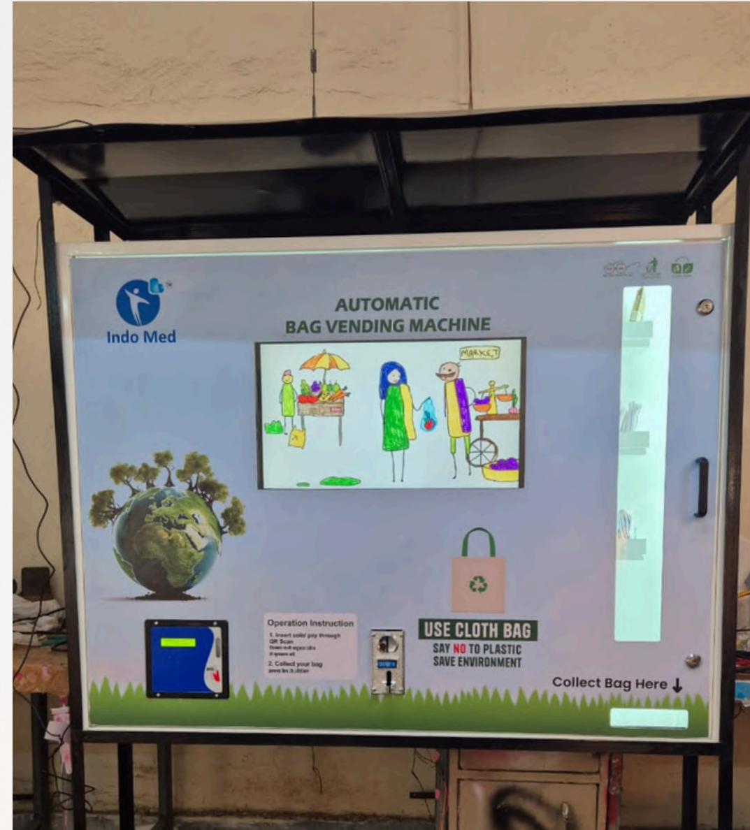
CLOTH BAG VENDING MACHINE