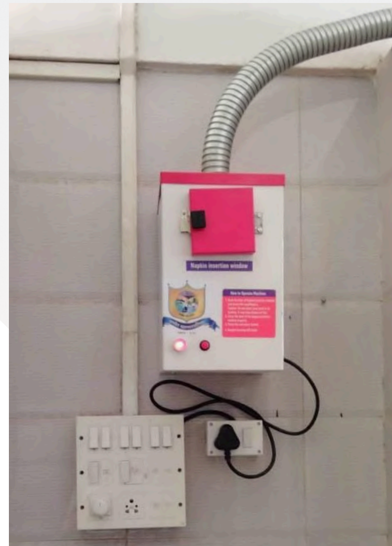
SANITARY NAPKIN INCINERATOR MACHINE