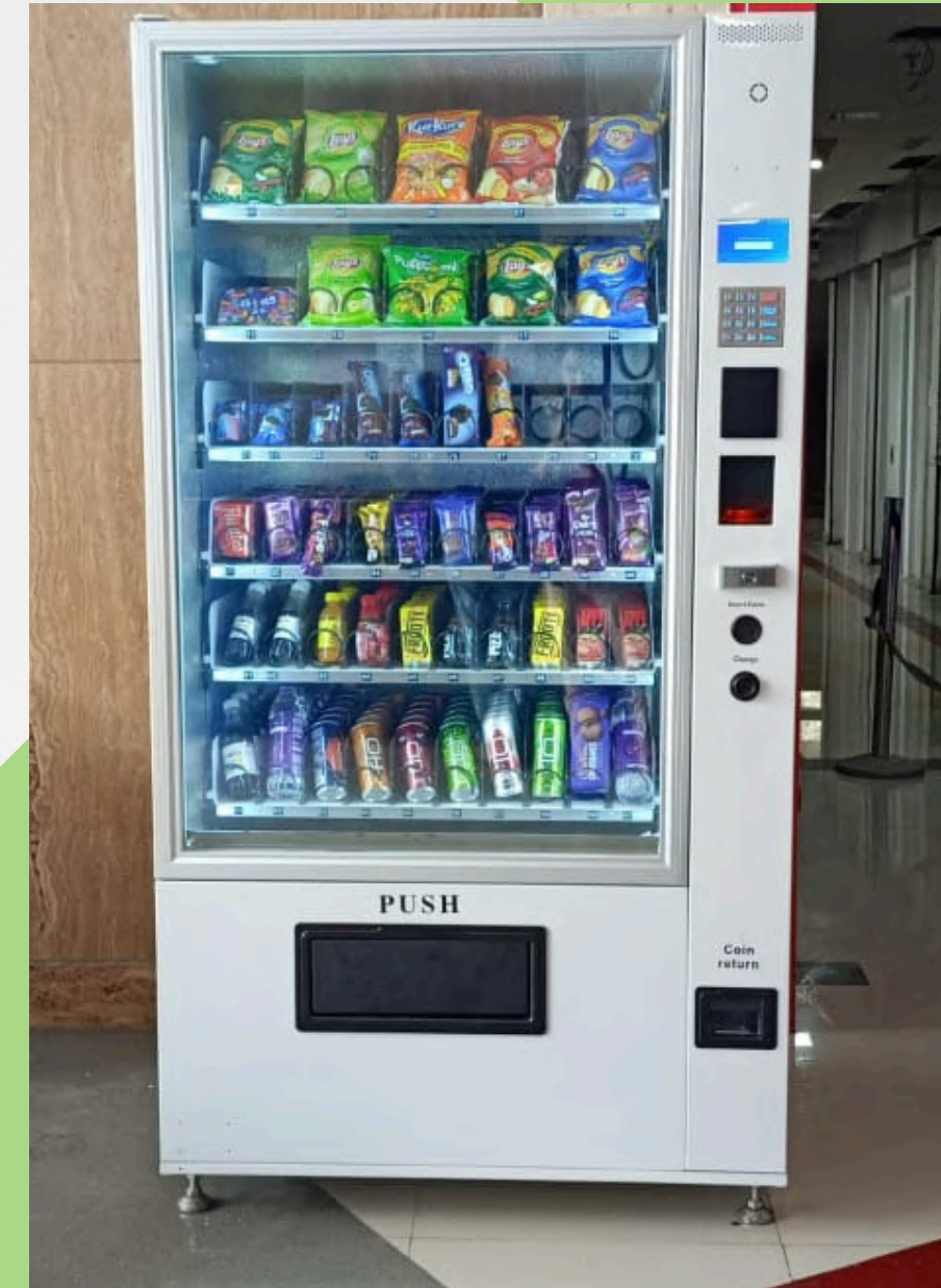
SNACKS AND BEVERAGE VENDING MACHINE