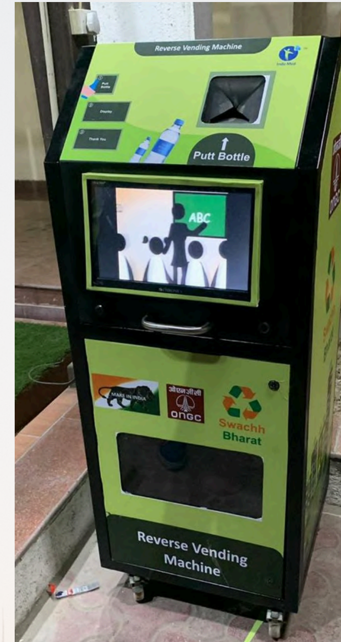
PET BOTLE CRUSHER