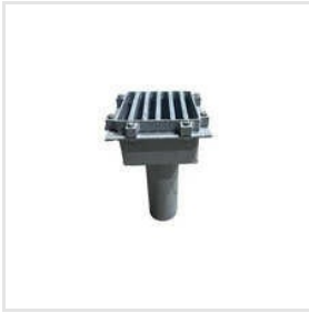
Bridges Drainage Spouts