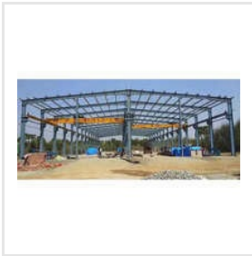
Peb Structures Fabrication