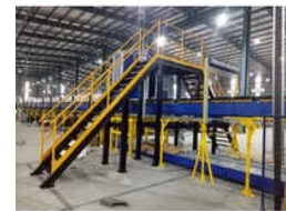
MEZZANINE FLOOR FABRICATION SERVICE