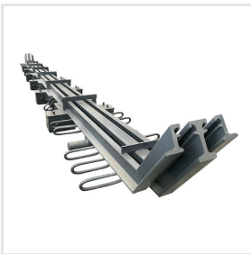
MODULAR EXPANSION JOINT