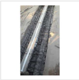
Bridge Strip Seal Expansion Joint