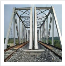
FOOT OVER BRIDGE