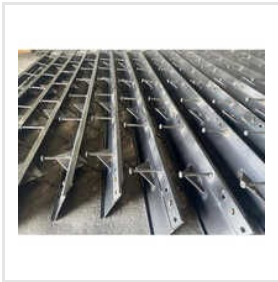
Steel Armour Joint