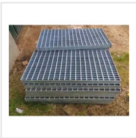
MS Grating Fabrication