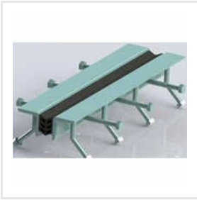
Compression Seal Expansion Joint