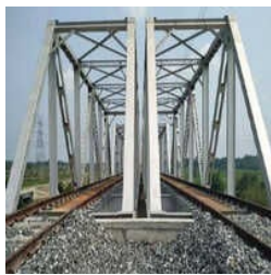
FOOT OVER BRIDGE

Bridge Strip Seal Expansion Joint, Bridges Drainage Spouts, Compression Seal Expansion Joint, DRAINAGE SPOUT, FINGER TYPE EXPANSION JOINT, FOOT OVER BRIDGE, MODULAR EXPANSION JOINT, MS Grating Fabrication , Mezzanine Floor Fabrication Service, Peb Structures Fabrication, Steel Armour Joint, Strip Seal Expansion Joint, etc.