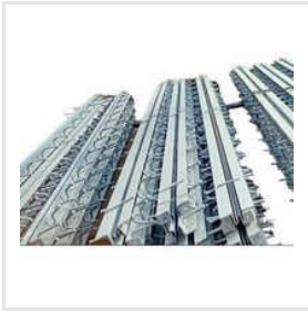
Strip Seal Expansion Joint