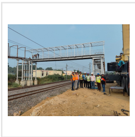
FOOT OVER BRIDGE