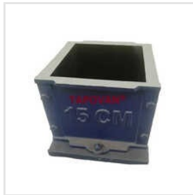
Industrial Cast Iron Cube Mould