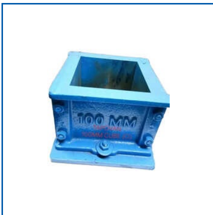
100 MM CAST IRON CUBE MOULD

100 MM Cast Iron Cube Mould, 15 CM Cast Iron Cube Mould, 15 CM PVC Cube Mould, 50 MM Mild Steel Cube Mould, 7 KG Cast Iron Cube Mould, 70.6 MM Mild Steel Cube Mould, 8 KG Cast Iron Cube Mould, 9 KG Cast Iron Cube Mould, Cast Iron Beam Mould, Cast Iron Gogo Clamp, Industrial Cast Iron Cube Mould, Light Weight Block Cutter Machine, Mild Steel Gogo Machine, Plastic Cube Mould, Square Cast Iron Cube Mould, etc.