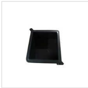
Plastic Cube Mould