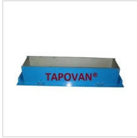
Cast Iron Beam Mould