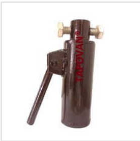
Mild Steel Gogo Machine