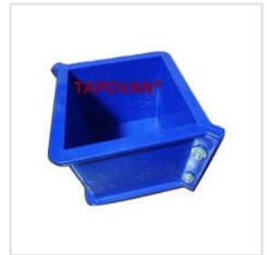
Square PVC Cube Mould