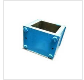
50 MM Mild Steel Cube Mould