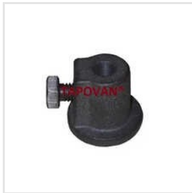
Cast Iron Gogo Clamp