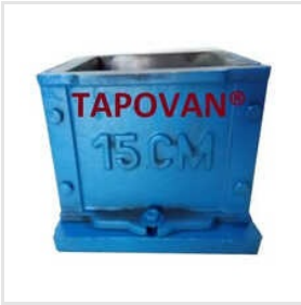
9 KG Cast Iron Cube Mould