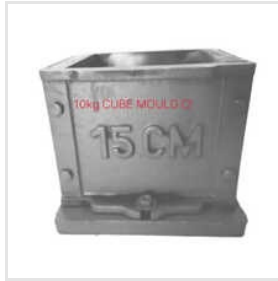
15 CM Cast Iron Cube Mould