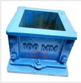
100 MM Cast Iron Cube Mould