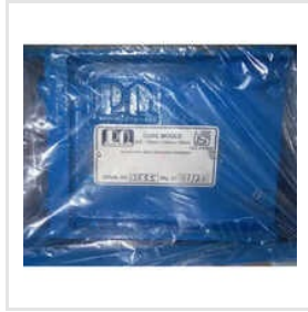
Square Cast Iron Cube Mould