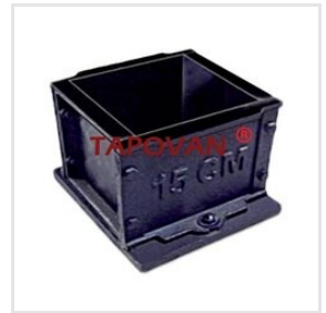
8 KG Cast Iron Cube Mould