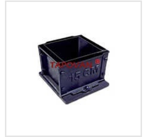
7 KG Cast Iron Cube Mould