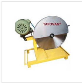
Light Weight Block Cutter Machine