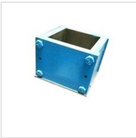
70.6 MM Mild Steel Cube Mould