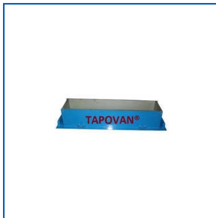
CAST IRON BEAM MOULD