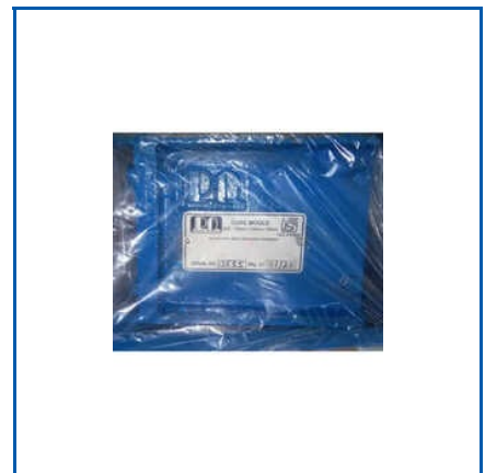
SQUARE CAST IRON CUBE MOULD