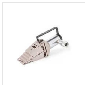
Hydraulic Flange Spreader