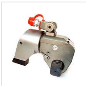
Hydraulic Torque Wrench