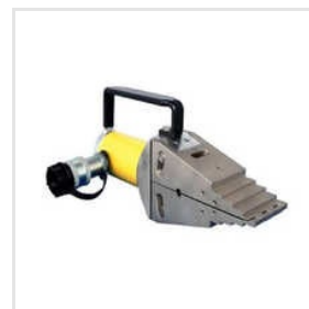
MS Hydraulic Flange Spreader