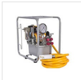
Pneumatic Hydraulic Torquing Pump