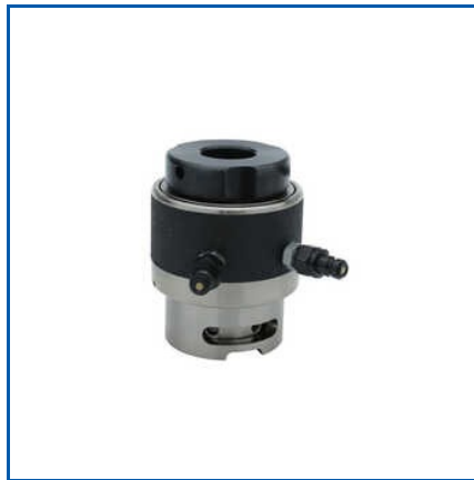
HYDRAULIC BOLT TENSIONER – 1INCH