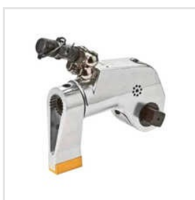
Hydraulic Torque Wrenches