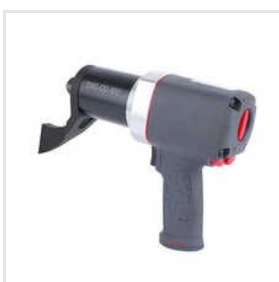
Pneumatic Torque Wrench