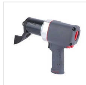
TBSPW Pneumatic Torque Wrenches