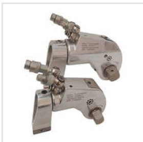
Square Drive Hydraulic Torque Wrench