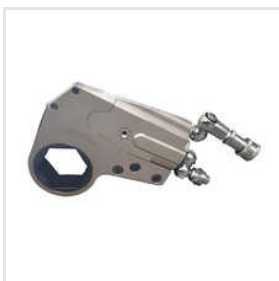
Hydraulic Hex Drive Torque Wrench