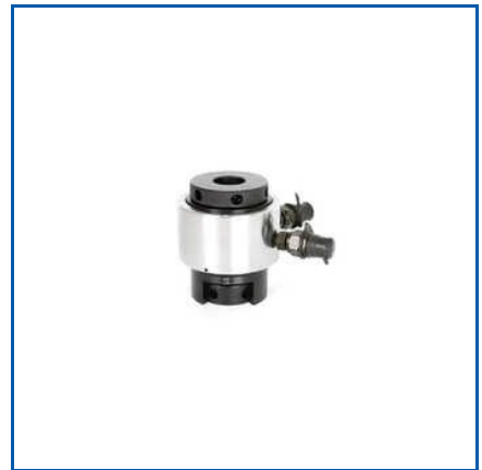
HYDRAULIC BOLT TENSIONER