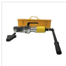
Integral Hydraulic Flange Spreader