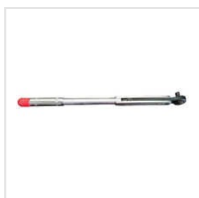
Manual Torque Wrench