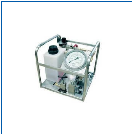
AIR OPERATED POWER PACK FOR BOLT TENSIONER

Air Operated Power Pack For Bolt Tensioner, Digital Electric Torque Wrench, Electric Hydraulic Torquing Power Pack, Electric Power Pack For Bolt Tensioner, Electric Torquing Power Pack, Hydraulic Bolt Tensioner, Hydraulic Bolt Tensioner – 1inch, etc.