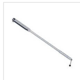
Ultra Light Weight Aluminum Alloy