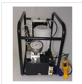
Electric Hydraulic Torquing Power Pack