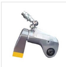
TBSQ Square Drive Hydraulic Torque