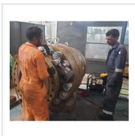
Hydraulic Torque Wrenches Rental