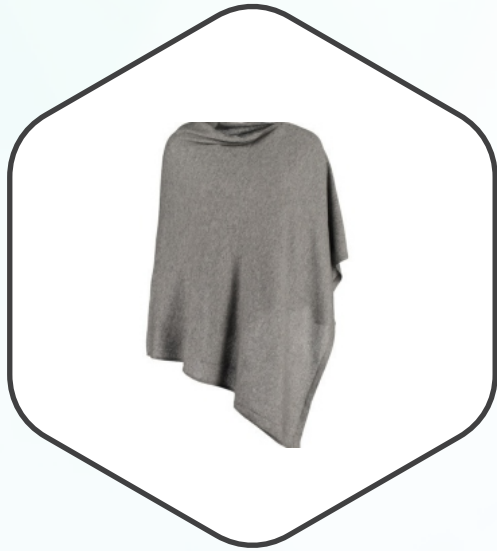
Ladies Plain Grey Poncho