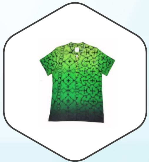
Mens Designer Digital Printed T-Shirt