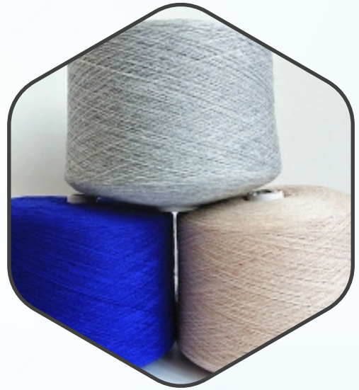
Pure Wool Yarn