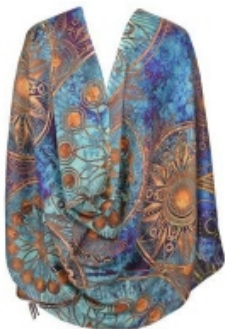
Modal Excel Linen Digital Printed Scarf