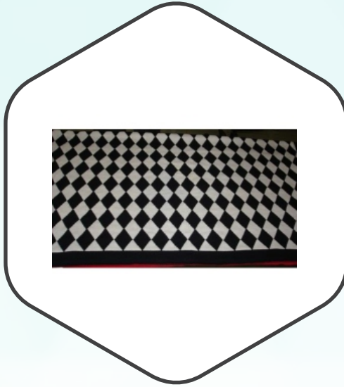
Black Printed Knitted Throws