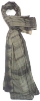
Cotton Tie Dye Scarf