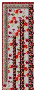
Merino Wool Digital Printed Scarf