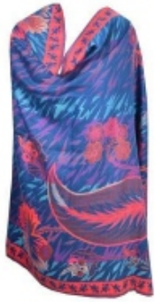
Ladies Fancy Shawl