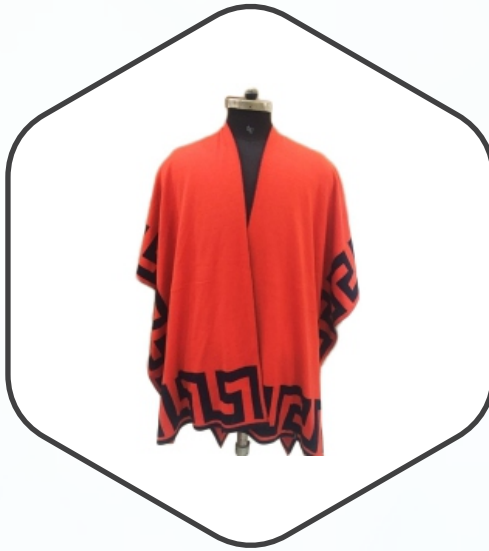
Ladies Printed Poncho