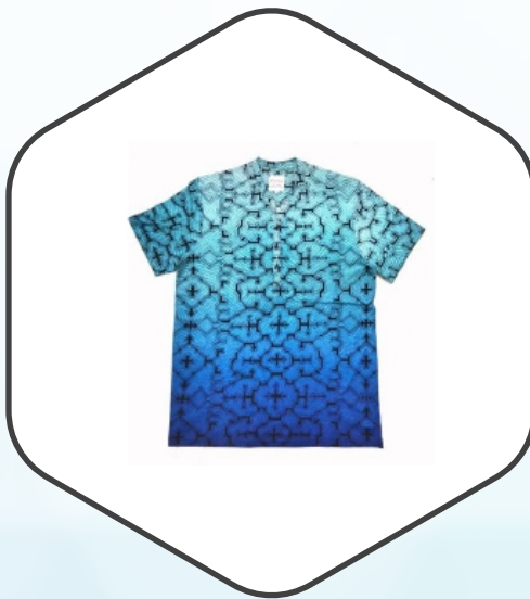
Mens Cotton Printed T-Shirt