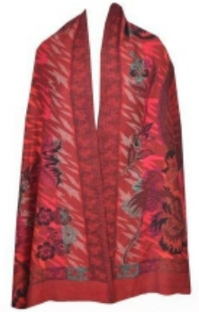
Ladies Printed Shawl