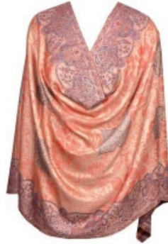
Ladies Designer Shawl