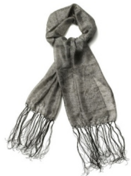
Ladies Fancy Scarf