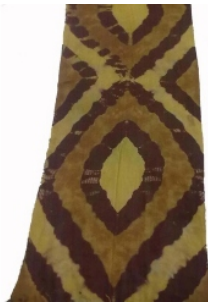
Cotton Tie Dye Long Scarf