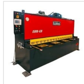
NC Shearing Machine