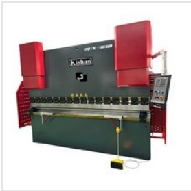
NC Front Cylinder Press Brake Machine