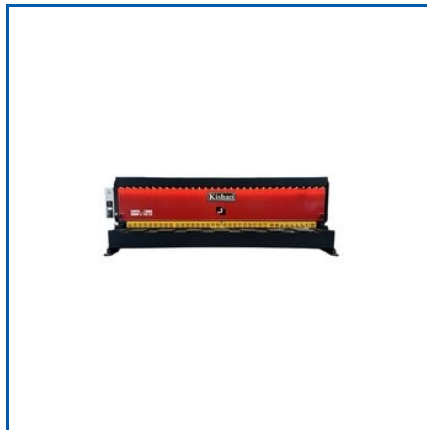
HYDRAULIC SHEARING MACHINE