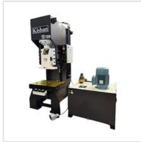
C Type Hydraulic Press