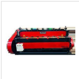
Mechanical Shearing Machine