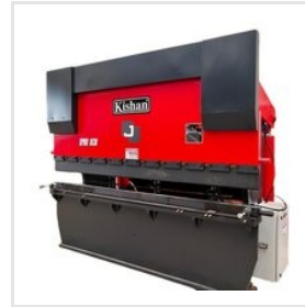
Hydraulic Press Brake Machine