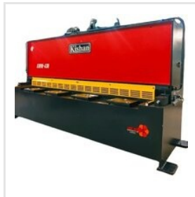
Hydraulic Variable Rake Angle Type