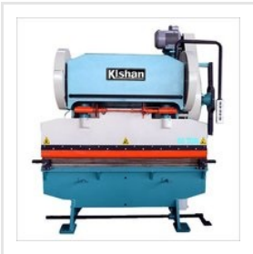
Cylinder CNC Press Brake Machine