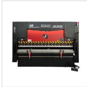
CNC Press Brake Machine