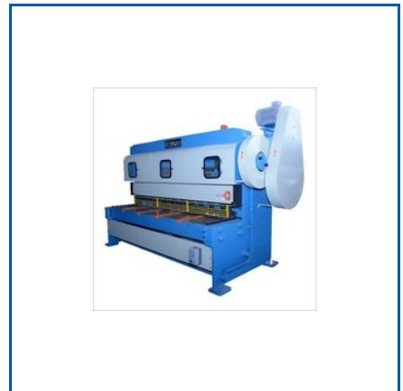
MECHANICAL SHEARING MACHINE