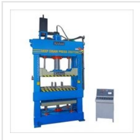
Heavy Duty Hydraulic Deep Draw Press