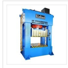
Hydraulic Press (H-C Type)