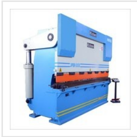
Hydraulic Rear Cylinder Type Press