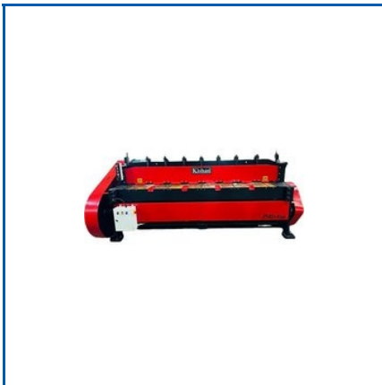
MECHANICAL UNDER CRANK SHEARING MACHINE

3 Roll Plate Rolling Machine, 3 Roll Screw Type Hydraulic Rolling Machine, 4 Roll Plate Rolling Machine, C Type Hydraulic Press, C Type Power Press Machine, CNC Press Brake Machine, Cylinder CNC Press Brake Machine, Fiber Laser Cutting Machine, Front Cylinder NC CNC Press Brake, H Type Hydraulic Press, Heavy Duty Hydraulic Deep Draw Press Machine, Hydraulic Iron Worker, Hydraulic Press (H-C Type), Hydraulic Press Brake Machine, Hydraulic Rear Cylinder Type Press Brake Machine, etc.