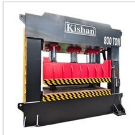
H Type Hydraulic Press