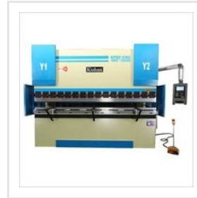
Front Cylinder NC CNC Press Brake