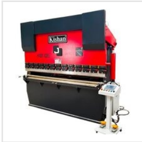
CNC Press Brake Machine