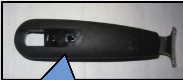
Space where we can fit plastic part with brand name