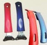
Double Screw Type Handle