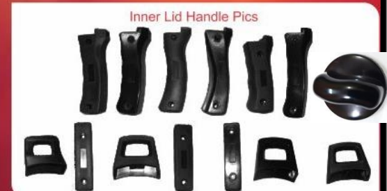
Inner Lid Handle Pics