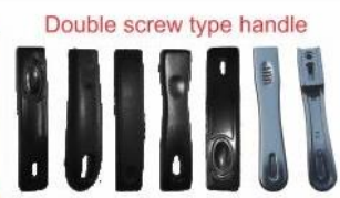
Double screw type handle