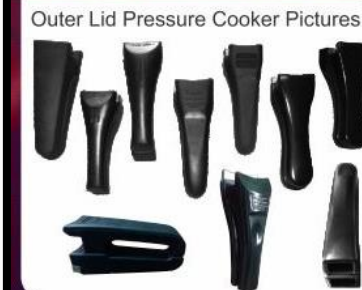
Outer Lid Pressure Cooker Pictures