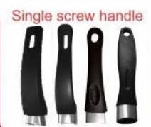
Single screw handle