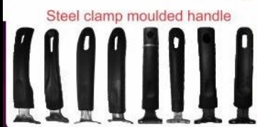
Steel clamp moulded handle