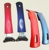
Double Screw Type Handle