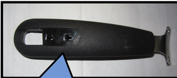
Space where we can fit plastic part with brand name