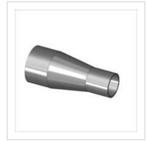
Concentric Reducer Aame Bpe