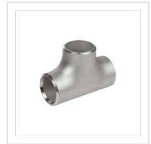
Stainless Steel Fittings