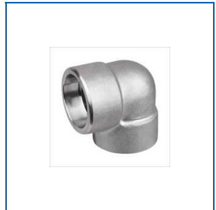
SOCKET WELD ELBOW