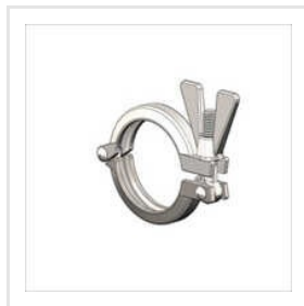
Light Duty Clamps