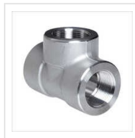
SS Threaded Tee