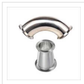
TC End Fittings