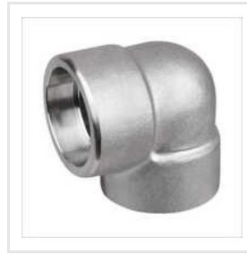
Socket Weld Elbow