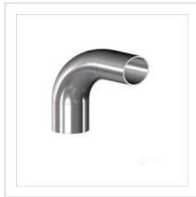
90 Deg Long Bend ASME BPE