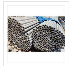
Stainless Steel Pipes