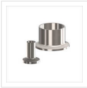
BS4825-3 Weld Ferrule