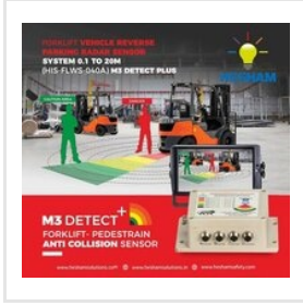
ANTI COLLISION DEVICE (HIS-FLWS-040A)