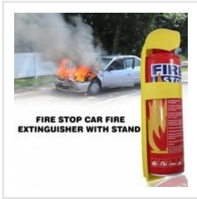
Car Fire Extinguisher