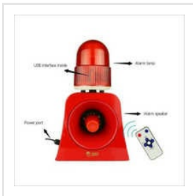
Overhead Crane Audio Visual Alarm With