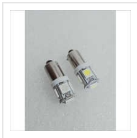
BA9s Replaceable LED Bulbs