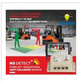
Forklift Anti-Collision Warning Alarm Device