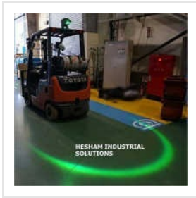
Arc Type 30w Forklift Safety Light