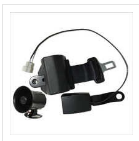
Forklift Seat Belt Alarm