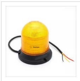
Rotating LED Beacon Light