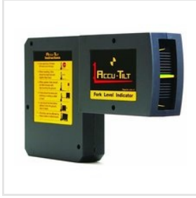
Fork Tilt Level Indicator For Forklifts And Lift