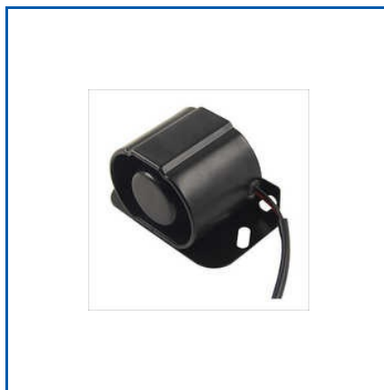
FORKLIFT TRUCK REVERSE WARNING ALARM