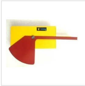
FORK LEVEL TILT INDICATOR