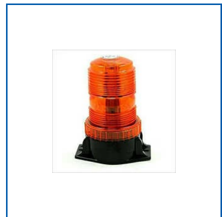
FORKLIFT REVOLVING WARNING LIGHT