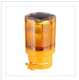
Solar Warning Light