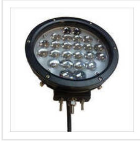
Overhead Crane Warning Light