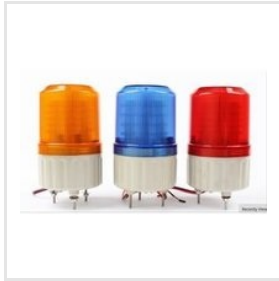
Revolving Warning Flashing Light