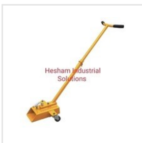
Forklift Fork Caddy (His-Flws-043)