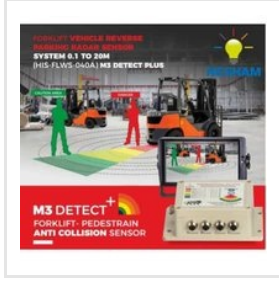
Forklift Reverse Sensor