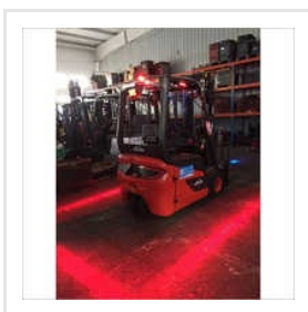
Forklift Red Zone Warning Light