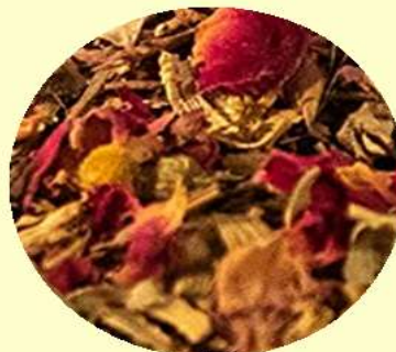
Anti Stress Tea