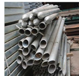
EARTHING ROUND PIPE