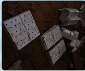
Transmission Tower Parts