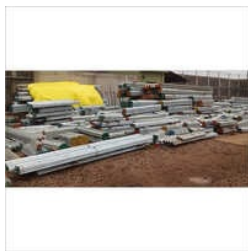
GI Substation Structures Parts