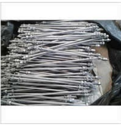
Substation Foundation Bolt