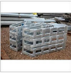
MS Substation Structure Parts