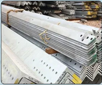
GI Z Channel