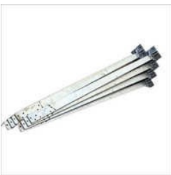
MS Substation Structures Channel