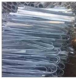
MS Earthing Strip