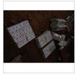
Transmission Tower Parts