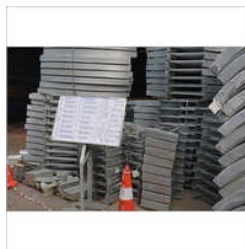
ELECTRICAL CABLE TRAY SUPPORT STRUCTURE