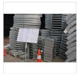
Electrical Cable Tray Support Structure