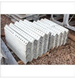
GI Substation Structures