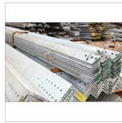
GI Z Channel