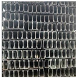
MS High Mast Pole