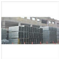
MS CABLE TRAY SUPPORT STRUCTURE

Earthing Round Pipe, Electrical Cable Tray Support Structure, GI Substation Structures, GI Substation Structures Parts, GI Transmission Tower Parts, GI Z Channel, MS Cable Tray Support Structure, MS Clamp, MS Cross Arm, MS Earthing Strip, MS High Mast Pole, MS Portal Substation Structure, MS Substation Structure Parts, MS Substation Structures Channel, Substation Foundation Bolt, etc.