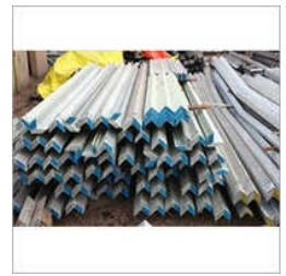
GI Transmission Tower Parts