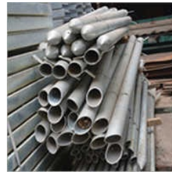
Earthing Round Pipe