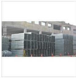
MS Cable Tray Support Structure