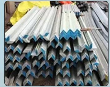
GI Transmission Tower Parts

Earthing Round Pipe, Electrical Cable Tray Support Structure, GI Substation Structures, GI Substation Structures Parts, GI Transmission Tower Parts, GI Z Channel, MS Cable Tray Support Structure, MS Clamp, MS Cross Arm, MS Earthing Strip, MS High Mast Pole, MS Portal Substation Structure, MS Substation Structure Parts, MS Substation Structures Channel, Substation Foundation Bolt, etc.