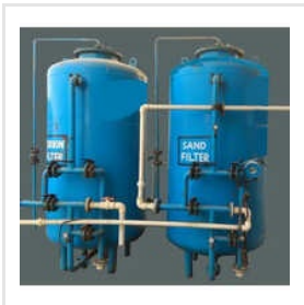
Sand Media Filter