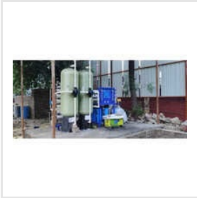
Industrial RO Water Purifier With Inbuilt U.V