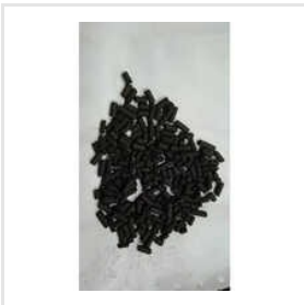
Activated Carbon Pellets