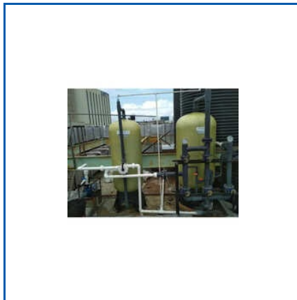
DOMESTIC WATER TREATMENT PLANT