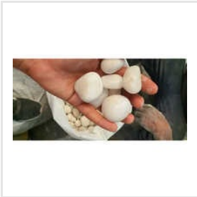
Water Filtration Pebbles