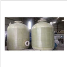
FRP Pressure Sand Filters & Water