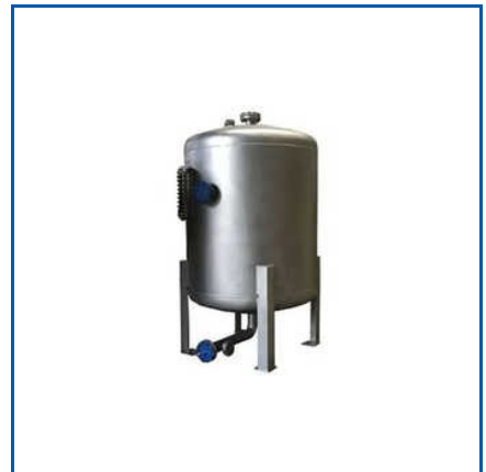
MGF AND ACF FILTER VESSEL