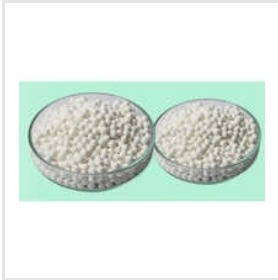
Activated Alumina Balls