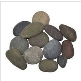
Pebble Stone For Water Filtration