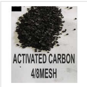
Granular Activated Carbon