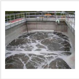
Automatic Sewage Treatment Plant