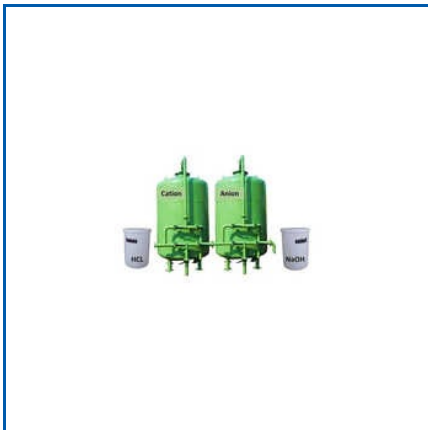
DM WATER PLANT

6-LPH E Dose Chemical Dosing Pumps, Activated Alumina Balls, Activated Carbon Granuels, Activated Carbon Pellets, Air Vacuum Valve, Automatic E Dose Neo Metering Pump, Automatic Organic Waste Composting Machine, Automatic Reverse Osmosis Systems, Automatic Sewage Treatment Plant, etc.