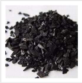
Activated Carbon Granuels