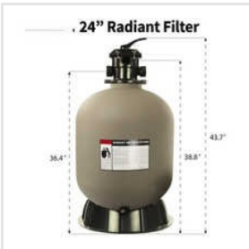
Pressure Sand Filters