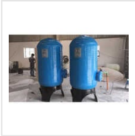
Dual Media Filter