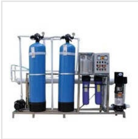
Industrial Reverse Osmosis Plant