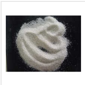
Water Filtration Sand