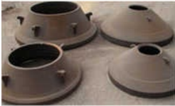
Concave Mantle Casting