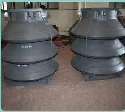
HIGH QUALITY CONCAVE MANTLE CASTING