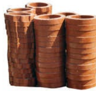
Power Plant Plain Hammers Casting