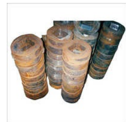
POWDER PLANT BEATER MACHINE CASTING