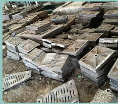
STONE CRUSHING MACHINE CASTING