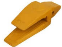
Tooth Point Adapter