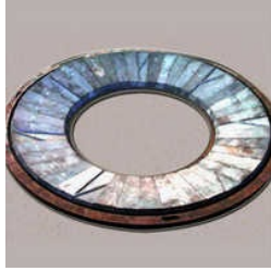
Bull Ring Segment