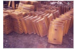
Power Plant Industrial Liners Casting