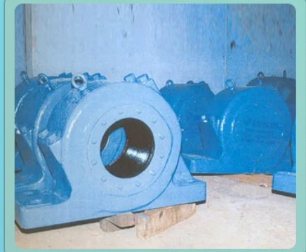
CEMENT PLANT ROLLER BEARING HOUSING CASTING

Austenitic Manganese Steel Castings, Ball Mill Liner, Blow Bar Steel Casting, Bowl Liner, Bull Ring Segment, Carbon Steel Castings, Casting Concave Mantle, Cement Plant Industrial Roller Bearing Casting, Cement Plant Roller Bearing Housing Casting, Chrome Steel Liner, Concave Mantle, Concave Mantle Casting, Jaw Plate, Metal Casting Crusher Hammer, Mining Apron Pan Casting, etc.