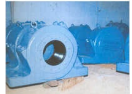
Cement Plant Roller Bearing Housing