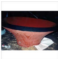
MINING MANTEL CASTING

Austenitic Manganese Steel Castings, Ball Mill Liner, Blow Bar Steel Casting, Bowl Liner, Bull Ring Segment, Carbon Steel Castings, Casting Concave Mantle, Cement Plant Industrial Roller Bearing Casting, Cement Plant Roller Bearing Housing Casting, Chrome Steel Liner, Concave Mantle, Concave Mantle Casting, Jaw Plate, Metal Casting Crusher Hammer, Mining Apron Pan Casting, etc.