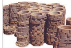
Power Plant Ring Hammers Casting