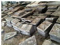
Stone Crushing Machine Casting