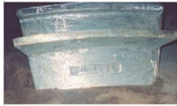
Cement Plant Industrial Roller