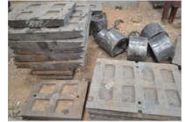
Stone Crusher Casting