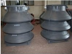
Casting Concave Mantle