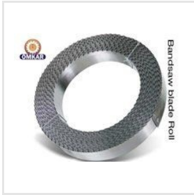
Bandsaw Blade Roll