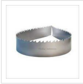
Chain Grinder Machine Blade