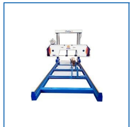
PORTABLE HORIZONTAL BANDSAW MACHINE OPBH-24