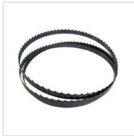
Wood Cutting Band Saw Blade