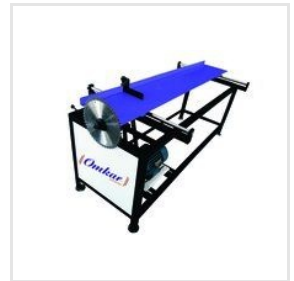
Circular Trolley Cutter Machine