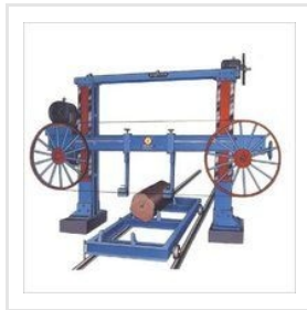
Horizontal Bandsaw Machines