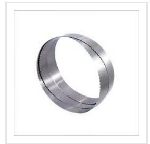
TCT Band Saw Blade