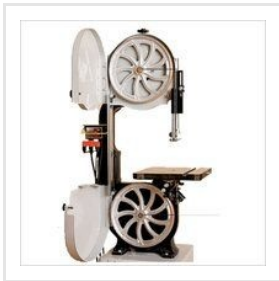
Horizontal Trolley Bandsaw Machine