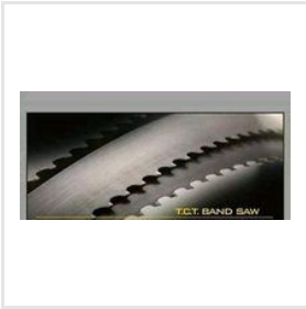
Carbide Tips Bandsaw Blade