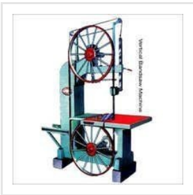
Wood Cutting Vertical Bandsaw Machine