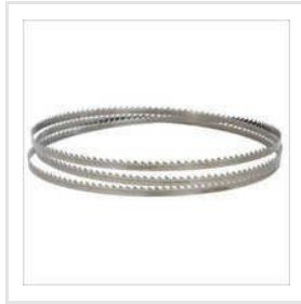
Wood Cutting Blade