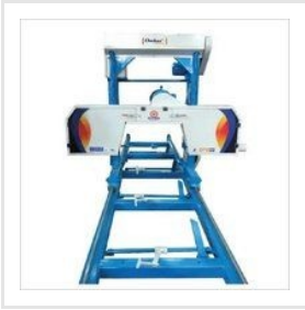
Portable Band Saw Machine