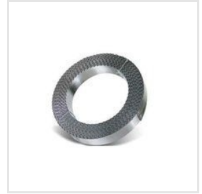
Band Saw Blade