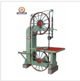
Vertical Bandsaw Machine OVB-24