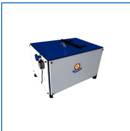
WOOD CUTTER MACHINE

Auto Blade Grinder Machine, Auto Teeth Setting Machine, Automatic Blade Grinding Machine, Automatic Teeth Setting Machine, Band Saw Blade, Bandsaw Blade Roll, Bandsaw Blades, Board Edger, Carbide Tips Bandsaw Blade, Chain Grinder Machine blade, Circular Trolley Cutter Machine, Horizontal BandSaw Machine 42", Horizontal Bandsaw Machines, Horizontal Trolley Bandsaw Machine, Manual Bench Grinder, etc.