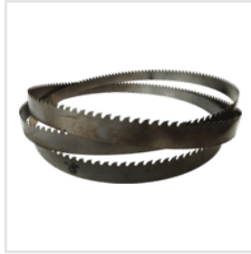
TCT Band Saw Blade