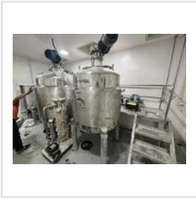
Syrup Manufacturing Plant