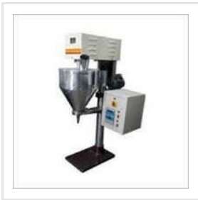
Manual Powder Filling Machine