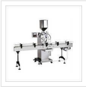
Fully Automatic Paste Filling Machine