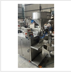
Semi Automatic Paste Filling Machine