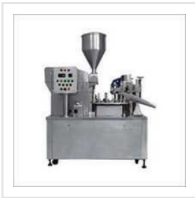
Semi Automatic Rotary Machine