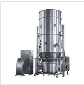
Fluid Bed Dryer