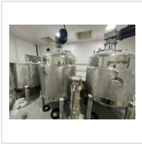
Syrup Mfg Plant