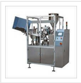
Fully Automatic Rotary Machine