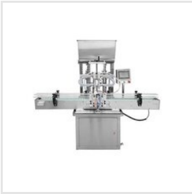
Manual Liquid Filling Machine