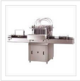
Semi Automatic Liquid Filling Machine