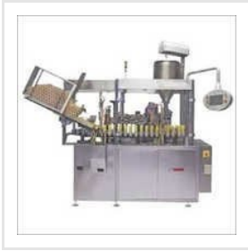
High Speed Linear Tube Filling Machine