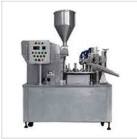
Rotary Tube Filling Machine