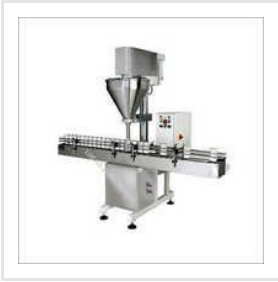
Fully Automatic Powder Filling Machine