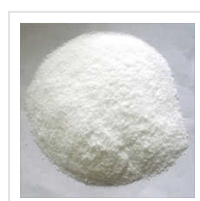
Vancomycin HCL Powder