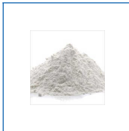
CAFFEINE ANHYDROUS POWDER