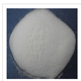
N- METHYL- L- PHENYLALANINE