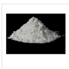
N- ETHYL BENZAMIDE