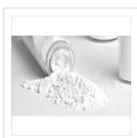
Sumatriptan Succinate Powder