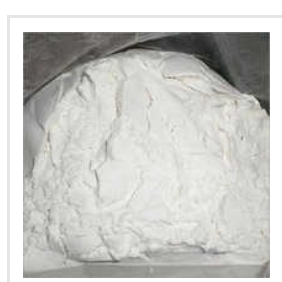
Dexmedetomidine HCL Powder