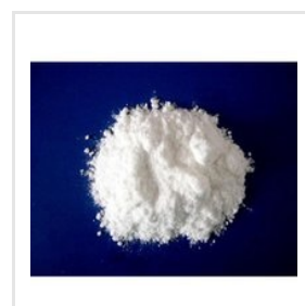
N- METHYL BENZAMIDE