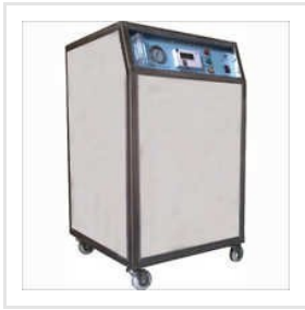
Dialysis RO System