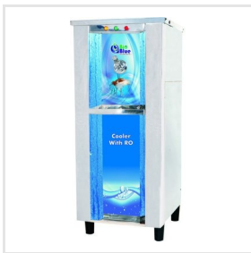
SS WATER COOLER