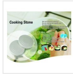
Bio Cooking Stone