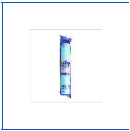
ALKALINE WATER FILTER