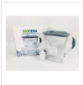
Biocera Alkaline Jug