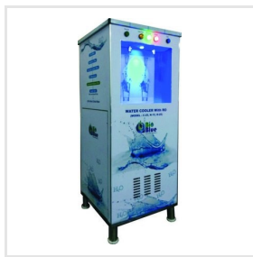
Cold Water Dispenser