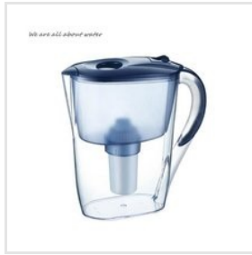
Biocera Alkaline Water Jug