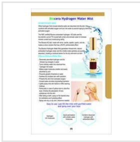
Biocera Hydrogen Water Mist