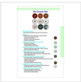
Bio Ceramic Balls