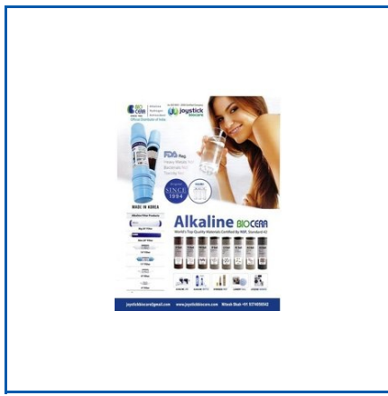
BIOCERA ALKALINE FILTER