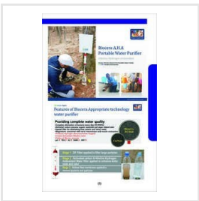
AHA PORTABLE WATER PURIFIER