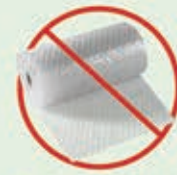
Replacement of plastic Air Bubble sheet

Honeycomb, is a very good eco-friendly product that replaces typical air bubble film made of plastic. It is lightweight material that has excellent compatibility with other materials and an excellent strength-to-weight ratio. It is also more economical packaging material, thereby making it an ideal choice, as honeycomb products are made from recyclable, bio degradable and bio compostable paper.