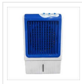
Sprint Nano Plastic Air Cooler