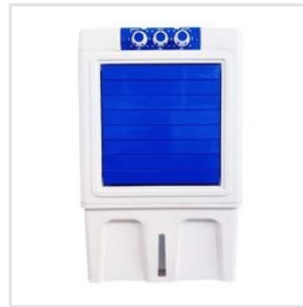
Sprint Junior Plastic Air Cooler Body