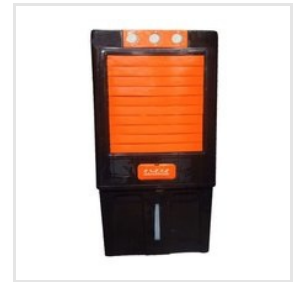
Sprint Sumo Tower Plastic Air Cooler Body