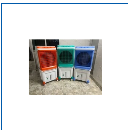
SPRINT NEXON COOLER TOWER