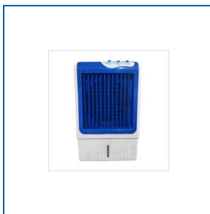
SPRINT NANO PLASTIC AIR COOLER