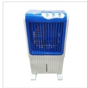
Sprint Junior Tower Air Cooler