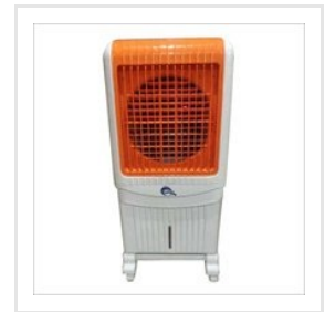
Sprint Jumbo Plus Tower Air Cooler