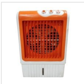
Sprint Nano Plastic Air Cooler Body