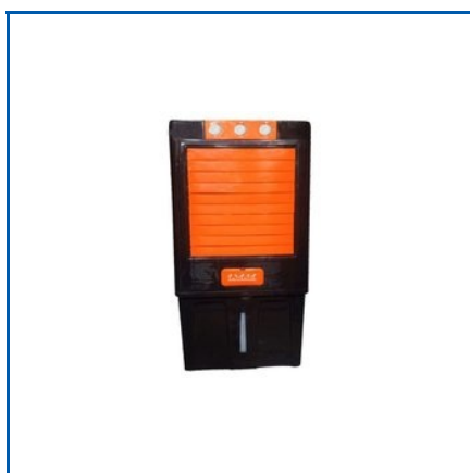
SUMO TOWER PLASTIC AIR COOLER

Domestic Plastic Air Cooler, Plastic Air Cooler Body, Sprint 16 Air Cooler Body, Sprint -16 Plastic Air Cooler Body, Sprint Jumbo Plus Tower Air Cooler, Sprint Jumbo Plus Tower Air Cooler Body, Sprint Junior Plastic Air Cooler Body, Sprint Junior Tower Air Cooler, Sprint Mini Tower Air Cooler Body, Sprint NEO Air Cooler, Sprint Nano Plastic Air Cooler, Sprint Nano Plastic Air Cooler Body, Sprint Nexon Cooler Tower, Sprint Plus Tower Air Cooler, Sprint Plus Tower Plastic Air Cooler Body, etc.