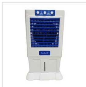
Sprint Plus Tower Plastic Air Cooler Body