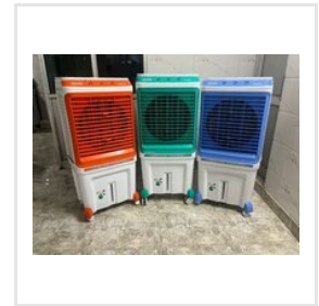
Sprint Nexon Cooler Tower