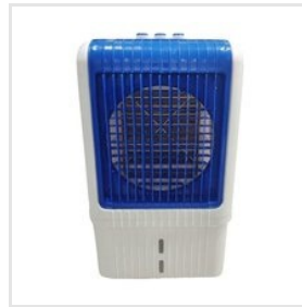
Sprint 16 Air Cooler Body