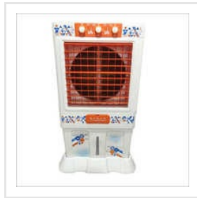
Sprint Plus Tower Air Cooler