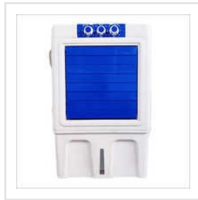
Plastic Air Cooler Body