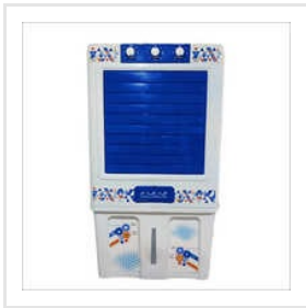
Domestic Plastic Air Cooler