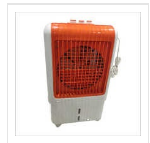
Sprint -16 Plastic Air Cooler Body