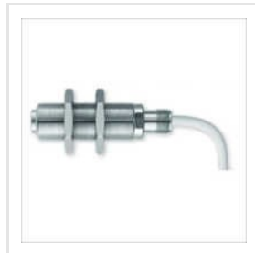
Speed And Direction Sensor