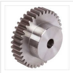
Stainless Steel Gears