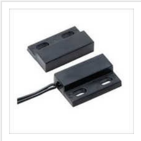
Magnetic Reed Sensor