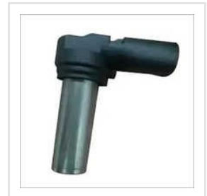
Rotational Speed Sensor