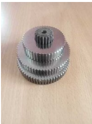
SENSOR TARGET WHEEL

4 Pole connector, Helical Gears, Magnetic Reed Sensor, Rotational Speed Sensor, Speed And Direction Sensor, Speed Sensor, Stainless Steel Gears, Timing Belt Pulleys, Worm Gears, sensor target wheel, etc.