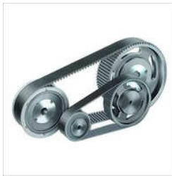
TIMING BELT PULLEYS