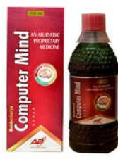
450ml Computer Mind Syrup