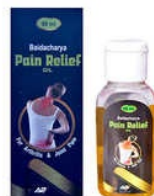
50ml Pain Oil