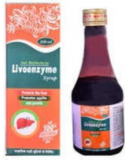
200ml Livoenzyme Syrup