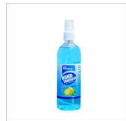
200ML HAND SANITIZER