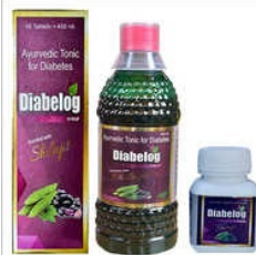
450ml Ayurvedic Tonic For Diabetes Syrup