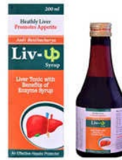
200ml Liv-Up Syrup