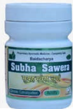
Subah Swera Churan