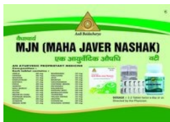
Baidacharya MJN (Maha Jawar Nashak)