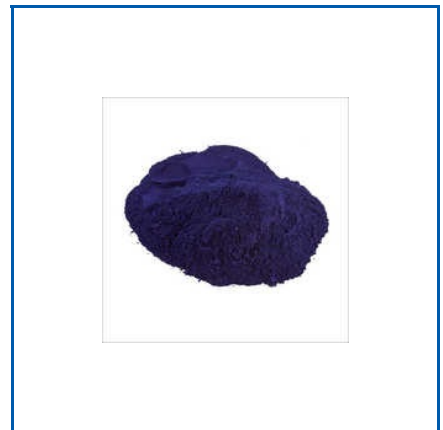
CPC BLUE ACTIVATED PIGMENT