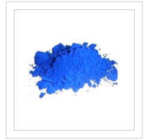
15:4 Blue Beta Pigment