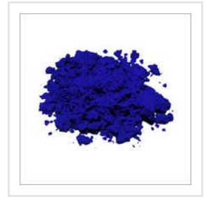
15:0 Blue Pigment