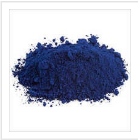
CPC Blue Crude