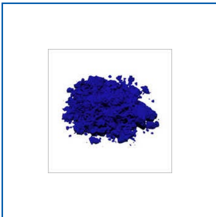
15:0 BLUE PIGMENT

15.1 Alpha Blue Pigment, 15:0 Blue Pigment, 15:2 Alpha Blue Pigment, 15:3 Blue Beta Pigment, 15:4 Blue Beta Pigment, Adbluee, Ammonium Carbonate (Solution), CPC Blue Activated Pigment, CPC Blue Crude, Green Pigment 7, Mono Sulpho CPC, etc.