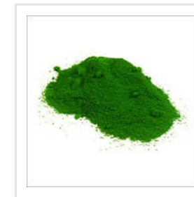
Green Pigment 7