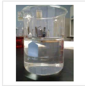
Ammonium Carbonate (Solution)