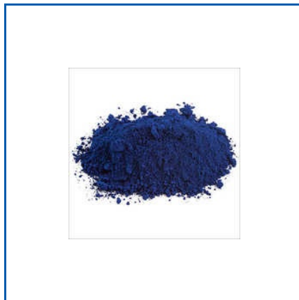
15:2 ALPHA BLUE PIGMENT