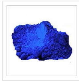
15:3 Blue Beta Pigment