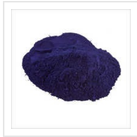
CPC Blue Activated Pigment