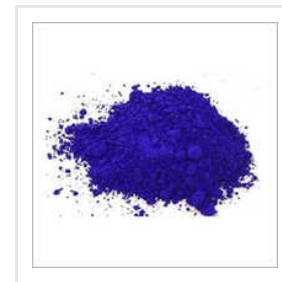
15.1 Alpha Blue Pigment