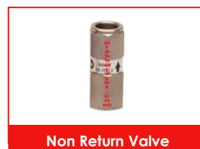
Non Return Valve