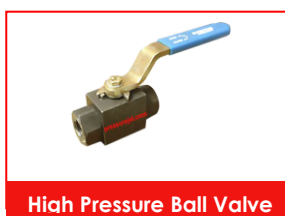
High Pressure Ball Valve