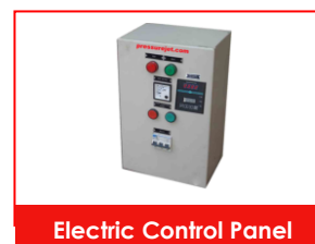
Electric Control Panel