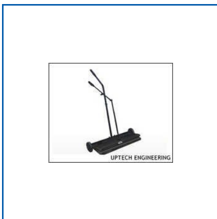
PERMANENT MAGNETIC SWEEPER

Angle Plate, Bearing v Block, Bevelled Edge Try Square, Coil Type Demagnetisers, Coil Type Demagnetizer, Compact Magnetic Lifters, Compound Sine Plate, De Magnetiser, Demagnetizers ., Epm Chuck for Horizontal Machine, Epm Plate Lifter, Electro Magnet, Electro Magnetic Square Block, Electro Permanent Magnetic Chuck, Electromagnetic Angle, Etc.