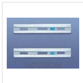
Hardened And Ground Steel Straight Edge