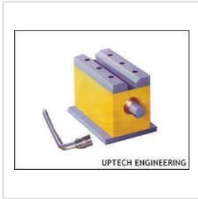
Permanent Magnetic Clamping Block