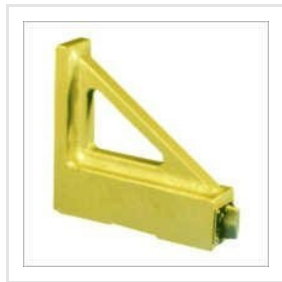
Magnetic Try Square