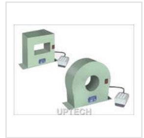
Coil Type Demagnetizer