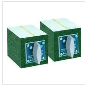
Magnetic Square Block