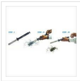
Magnetic Separator On Off Type