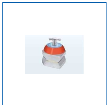
MAGNETIC HOLDING DEVICES