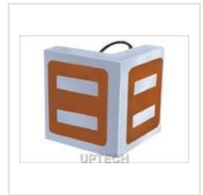
Electromagnetic Angle Separator