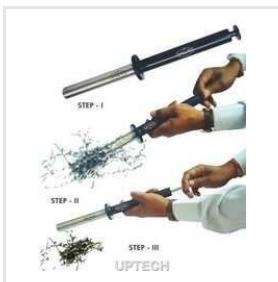
Magnetic Stick On And Off Type