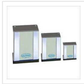
Magnetic Sheet Separator (Floater)