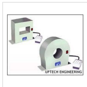
Coil Type Demagnetisers