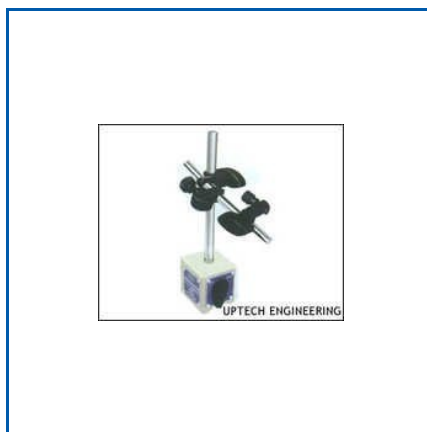
MAGNETIC BASES WITH FINE ADJUSTMENT