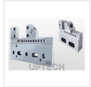
Stainless Steel EDM Vice