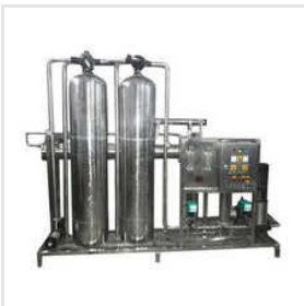
Stainless Steel Industrial RO Plant