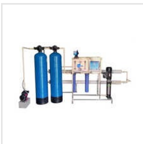
1000 LPH Industrial Reverse Osmosis Plant