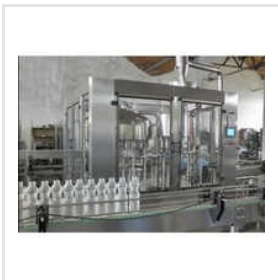
30 BPM Water Bottling Machine