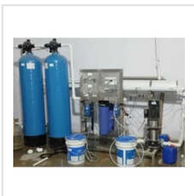
Industrial Water Purifier