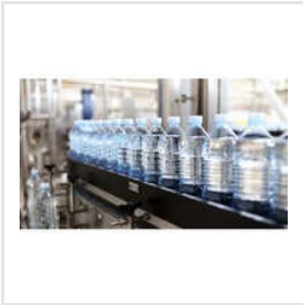
Automatic Drinking Water Bottling Plant