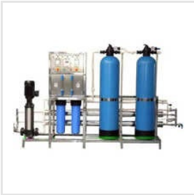
1000 L Water Purification Machine