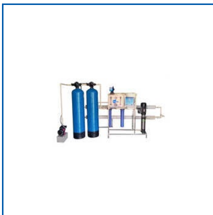
2000 LPH RO PLANT

1000 L Water Purification Machine, 1000 LPH Industrial Reverse Osmosis Plant, 2000 LPH RO Plant, 250 LPH RO Water Purifier, 30 BPM Water Bottling Machine, 500 LPH Commercial Reverse Osmosis System, 500 Lph Industrial Reverse Osmosis Plant, Automatic Drinking Water Bottling Plant, Automatic Filling Machine, Automatic Mineral Water Bottling Plant, Commercial Water Bottling Plant, Fruit Juice Processing Plant, Industrial RO System, Industrial Water Purifier, Mineral Water Filling Machine, etc.