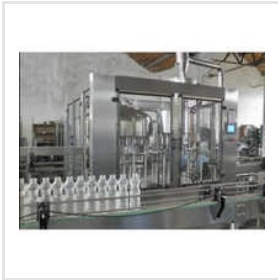
Mineral Water Plant