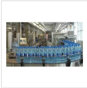
Pet Stretch Blowing Machine