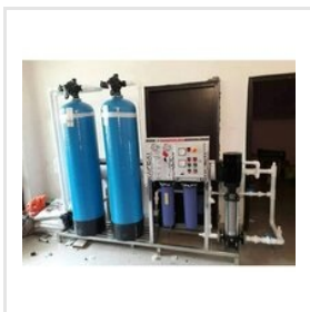
500 LPH Industrial Reverse Osmosis Plant