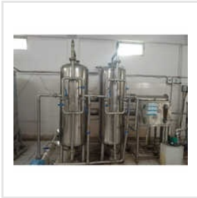
Semi Automatic Mineral Water Plant