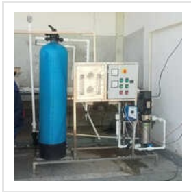
250 LPH RO Water Purifier