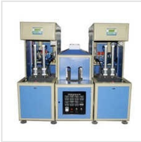
Water Bottle Making Machine