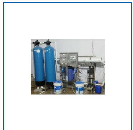
REVERSE OSMOSIS SYSTEM