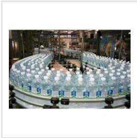
Stainless Steel Mineral Water Bottling Plant