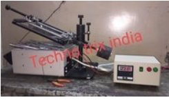
Semi Automatic Dip Soldering Machine