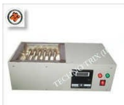
Dip Soldering Machine With Temperature