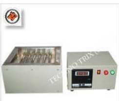
Manual Dip Soldering Machine