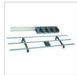
PCB ASSEMBLY EQUIPMENTS