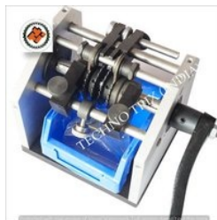
RESISTANCE CUTTING AND BENDING MACHINE