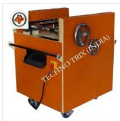
PCB LEAD CUTTING MACHINE

Automated Conveyor System, Automatic Big Resistor Cutting Bending Machine, Automatic Dip Soldering Machine, Automatic Wire Stripping Cum Twisting Machine, Big Resistor Cutting Bending Machine (Horizontal type), Big Resistor Cutting Bending Machine (Vertical type), Conveyor System, Cutting Blade Sharpening Machine, Dip Soldering Machine with Temperature Controller, Flat Belt Conveyor, LED Cap Crimping Machine, LED Tikki Pressing Machine, Manual Blister Sealing Machine, Manual Dip Soldering Machine, Manual Insertion Conveyors, etc.