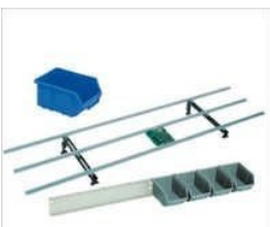
Table Top Conveyor