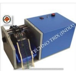
Motorized Cut And Bend Machine