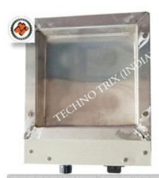
Thermostate Dip Soldering Machine