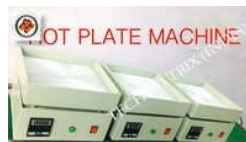
Smd Hot Plate