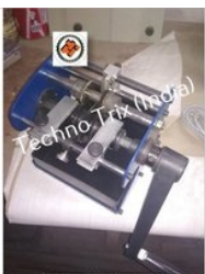
Big Resistor Cutting Bending Machine