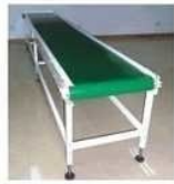
Flat Belt Conveyor