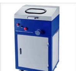
Cutting Blade Sharpening Machine