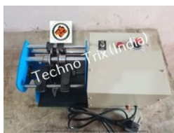
Automatic Big Resistor Cutting Bending