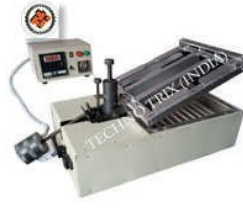
Automatic Dip Soldering Machine