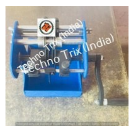
Big Resistor Cutting Bending Machine