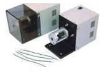
Automatic Wire Stripping Cum Twisting