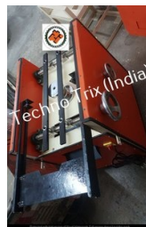
Semi Automatic PCB Lead Cutting Machine