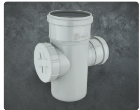
REDUCER TEE (DOOR)