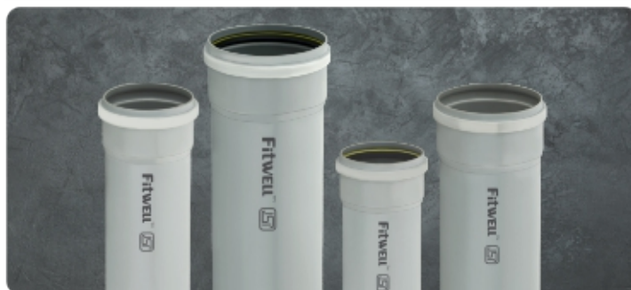
FITWELL SWR PIPES (A-TYPE) LIGHT