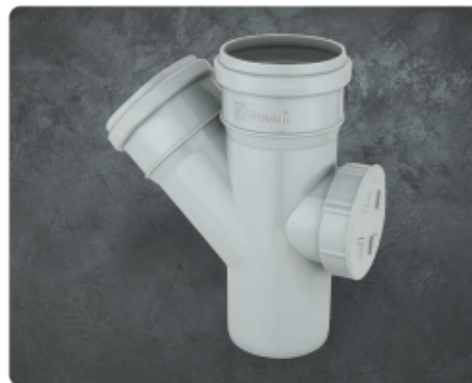
SINGLE Y (DOOR)