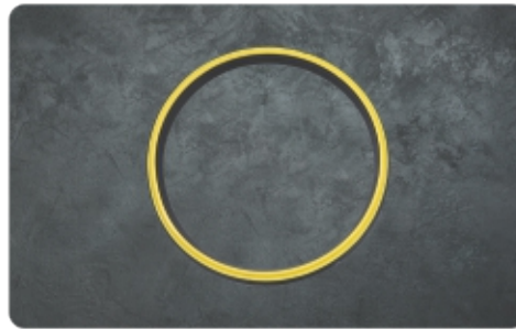
PP SWR RING (Fix Rate)