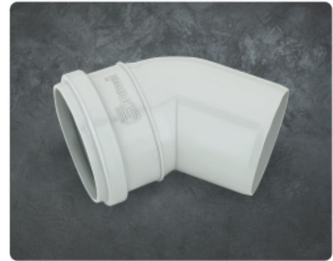
SHOE BEND 45