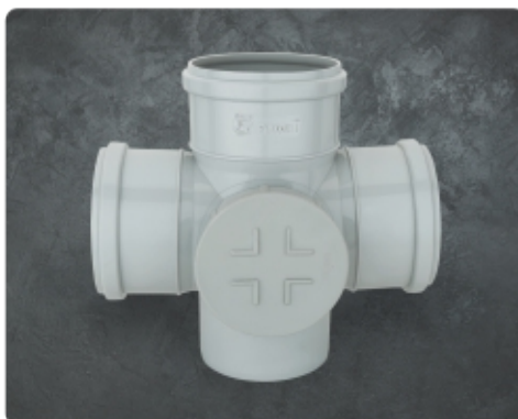
DOUBLE TEE (DOOR)