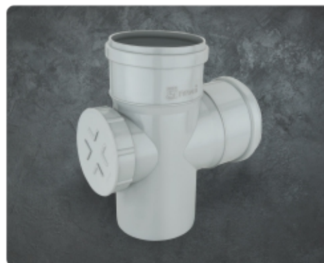
SINGLE TEE (DOOR)