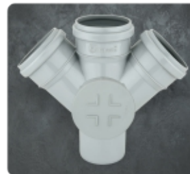
DOUBLE Y (DOOR)