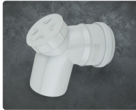
BEND 87.5" (DOOR)