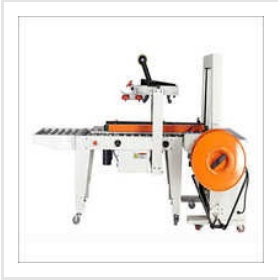
M3-6 Combo Strapping With Sealer