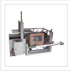
Case Erector Sealer Machine