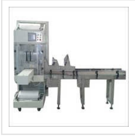
M2-5 Bottle Wrapper Machine