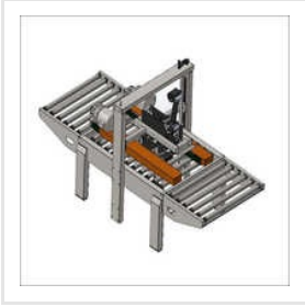
Side Drive Carton Sealer Machine