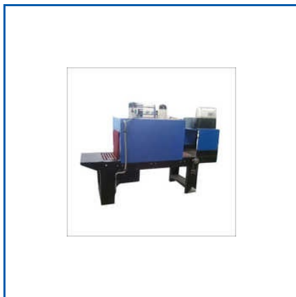
M2-1 SHRINK TUNNEL WRAPPER MACHINE