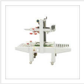
Carton Sealer Machine