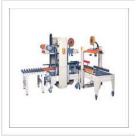
Edge Type Carton Sealer Machine