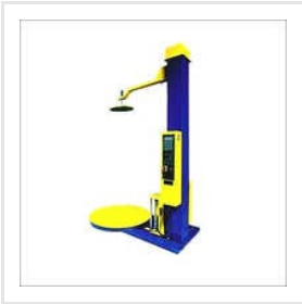
M5-2 Autopallet Stretch Wrapper