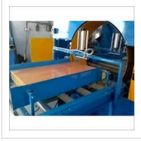
M5-5 Ring Wrapper Horizontal Machine