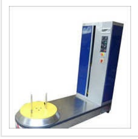
Luggage Wrapping Machine