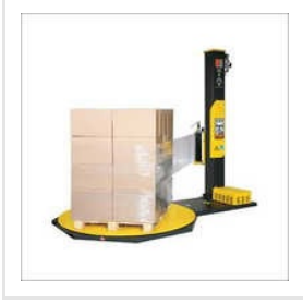
M5-1 Semi Auto Pallet Stretch Wrapper