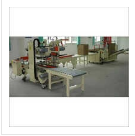
Pick N Place