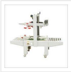
M3-8 Random Carton Sealer Machine