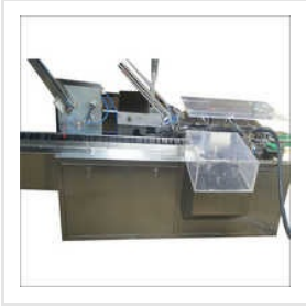
M3-11 Auto Cartonating Machine