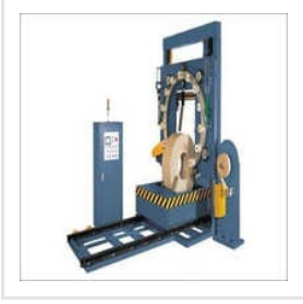
M5-4 Ring Wrapper Vertical Machine