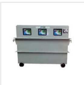
20 KVA Three Phase Oil Cooled Servo Voltage