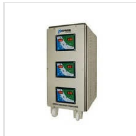
15 KVA Air Cooled Servo Voltage Stabilizer