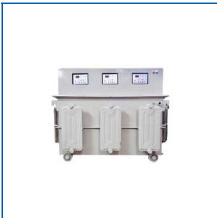
3 PHASE OIL COOLED SERVO VOLTAGE STABILIZER

1 KVA Single Phase Isolation Transformer, 10 KVA Three Phase Isolation Transformer, 15 KVA Air Cooled Servo Voltage Stabilizer, 1500kva Roller Type Auto Voltage Regulator, 20 KVA Three Phase Oil Cooled Servo Voltage Stabilizer, 200 KVA L. T. Automatic Voltage Stabilizer, 250 Kva Three Phase Transformer, 3 Phase Oil Cooled Servo Voltage Stabilizer, 5 KVA UPS System, 60 Kva 3 Phase Isolation Transformer, Constant Voltage Transformer, Digital Servo Voltage Stabilizer, Double Phase Servo Voltage Stabilizer, Oil Cooled Servo Stabilizers, Step Down Three Phase To Single Phase Transformer, etc.