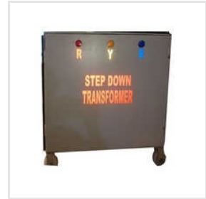
Step Down Three Phase To Single Phase