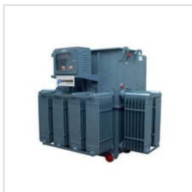
200 KVA L. T. Automatic Voltage Stabilizer