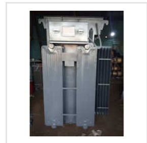
1500kva Roller Type Auto Voltage Regulator