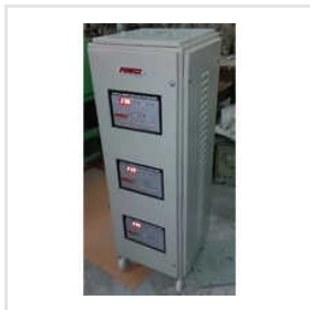
Three Phase Voltage Stabilizer