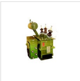
250 Kva Three Phase Transformer