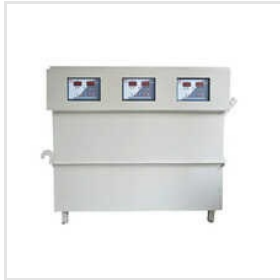
Oil Cooled Servo Stabilizers