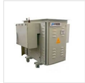
1 KVA Single Phase Isolation Transformer