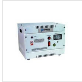
Constant Voltage Transformer