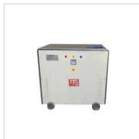
60 Kva 3 Phase Isolation Transformer