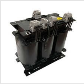
10 KVA Three Phase Isolation Transformer