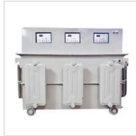
Digital Servo Voltage Stabilizer