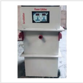
Double Phase Servo Voltage Stabilizer