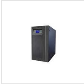
5 KVA UPS System