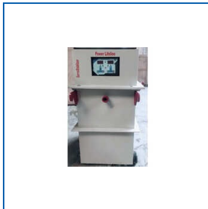
DOUBLE PHASE SERVO VOLTAGE STABILIZER