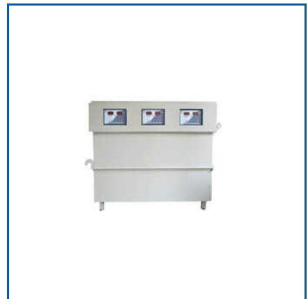
OIL COOLED SERVO STABILIZERS