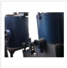
Plastic Mixer Machine