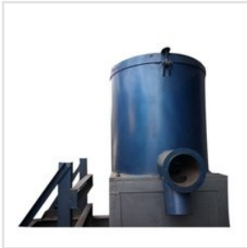
Plastic Mixer Machine