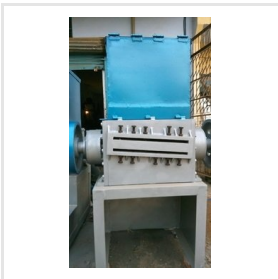
Plastic Scrap Grinder Machine