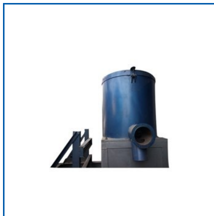
PLASTIC MIXER MACHINE