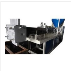
Plastic Dana Making Machine