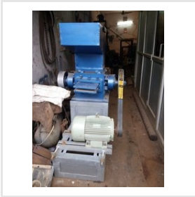
Plastic Scrap Grinder Machine