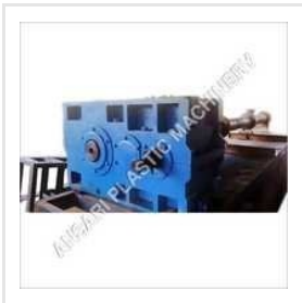
Plastic Dana Machine