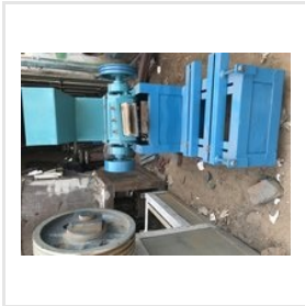
Plastic Scrap Grinder Machine