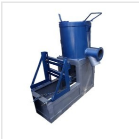
Plastic Mixer Machine