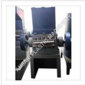
Plastic Scrap Grinder Machine