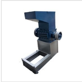
Plastic Scrap Grinder Machine