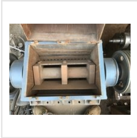
Plastic Scrap Grinder Machine