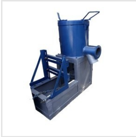
Plastic Mixer Machine