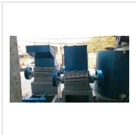
Plastic Scrap Grinder Machine