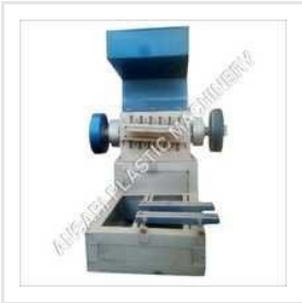
Plastic Scrap Grinder Machine