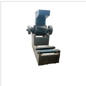
Plastic Scrap Grinder Machine