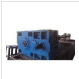
Plastic Dana Making Machine