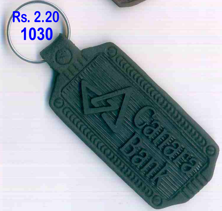
Rs. 2.20 1030