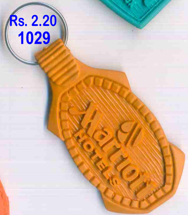
Rs. 2.20 1029