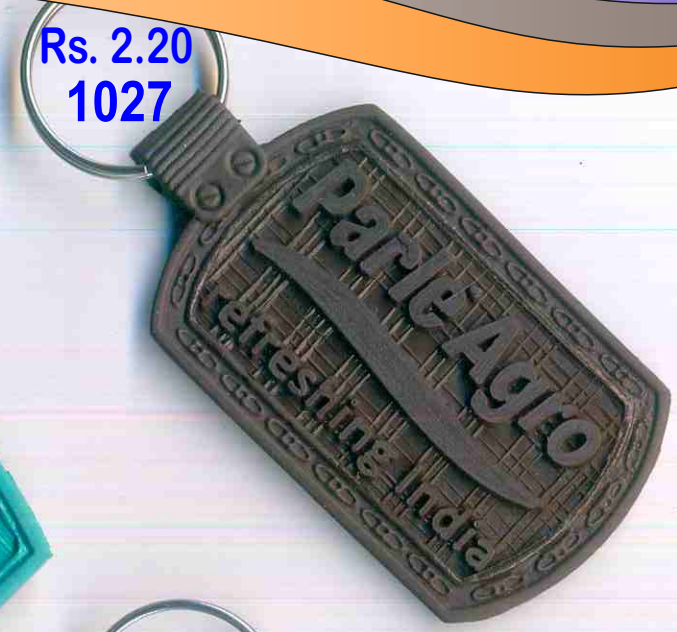
Rs. 2.20 1027