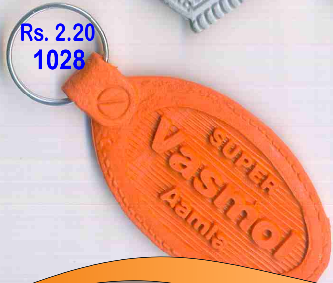
Rs. 2.20 1028