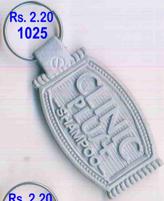
Rs. 2.20 1025