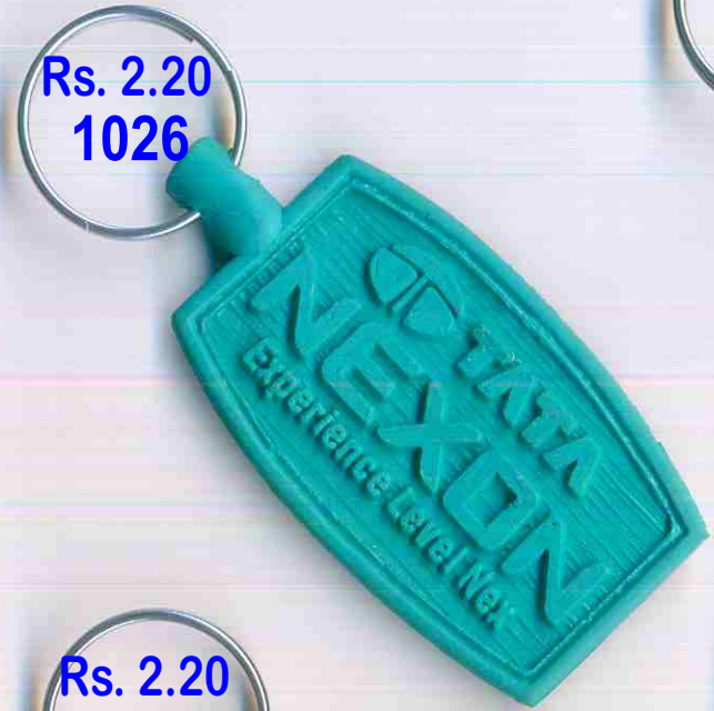
Rs. 2.20 1026