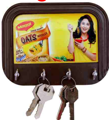
Rs. 19.50 Item No. 12067

PRINT AREA: 59X99.5 PRODUCT SIZE: 98X125