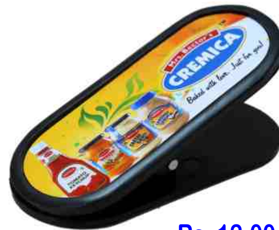
Rs. 12.00 Item No. 12044