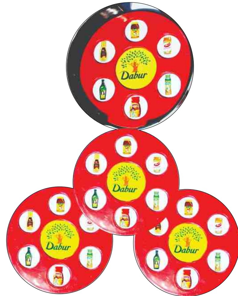
Rs. 42.50 Item No. 12006