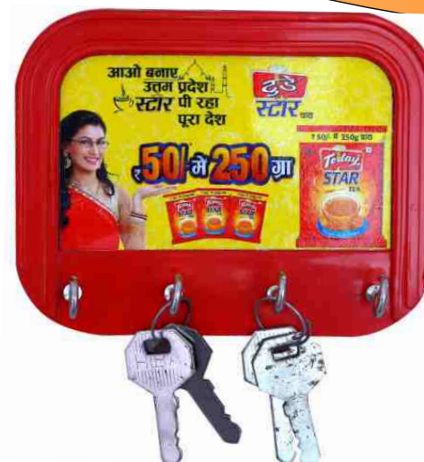
Rs. 19.50 Item No. 12069