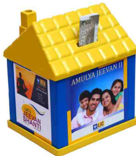
Rs. 69.00 Item No. 12026

PRINT AREA: 75X90 : 100X90 OUTER SIZE : 75X101 : 100X101 PRODUCT SIZE: 110X135=160H