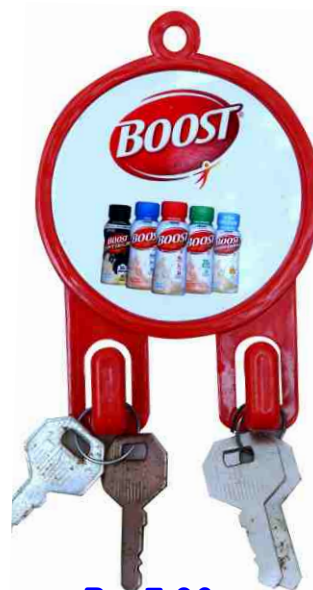
Rs. 7.90 Item No. 12074