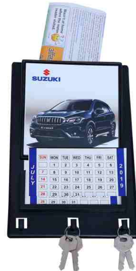
Rs. 73.50 Item No. 12087