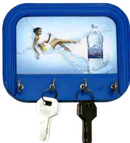
Rs. 19.50 Item No. 12068