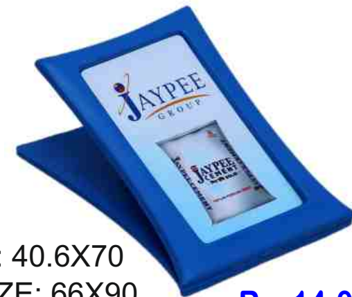
Rs. 14.00 Item No. 12048