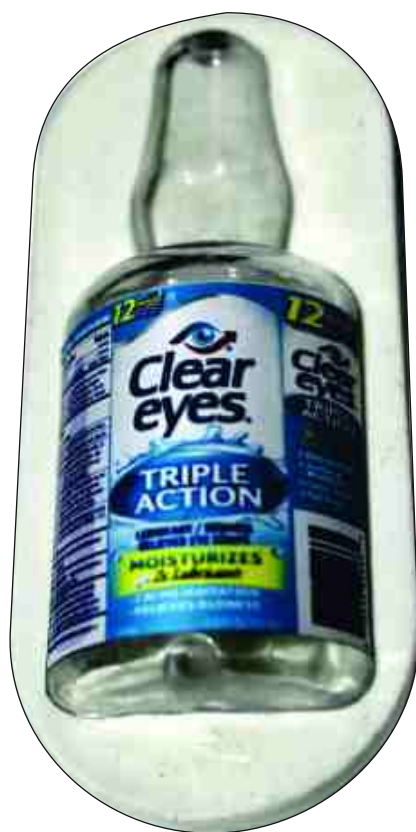
Rs. 19.10 Item No. 12049