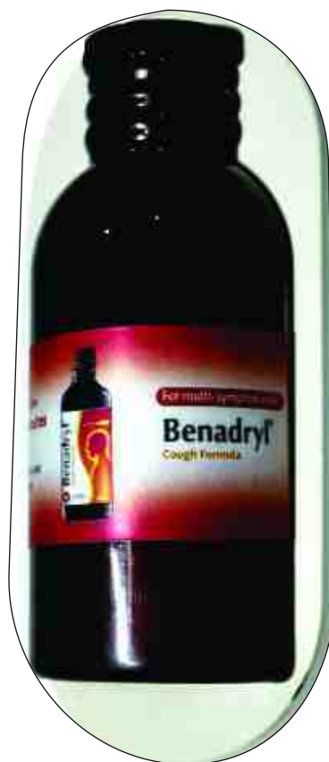
Rs. 19.10 Item No. 12050