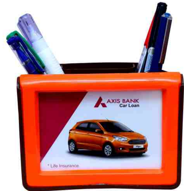
56.00 Item No. 12024

PRINT AREA: 81X117 OUTER SIZE : 107X147 PRODUCT SIZE: 105X160=76H