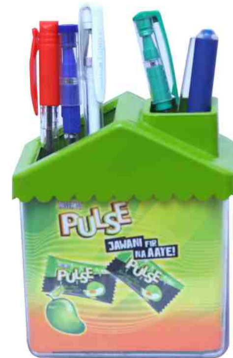
Rs. 47.00 Item No. 12013

PRINT AREA: 70X260 OUTER SIZE : 85X290 PRODUCT SIZE: 60X100=117H