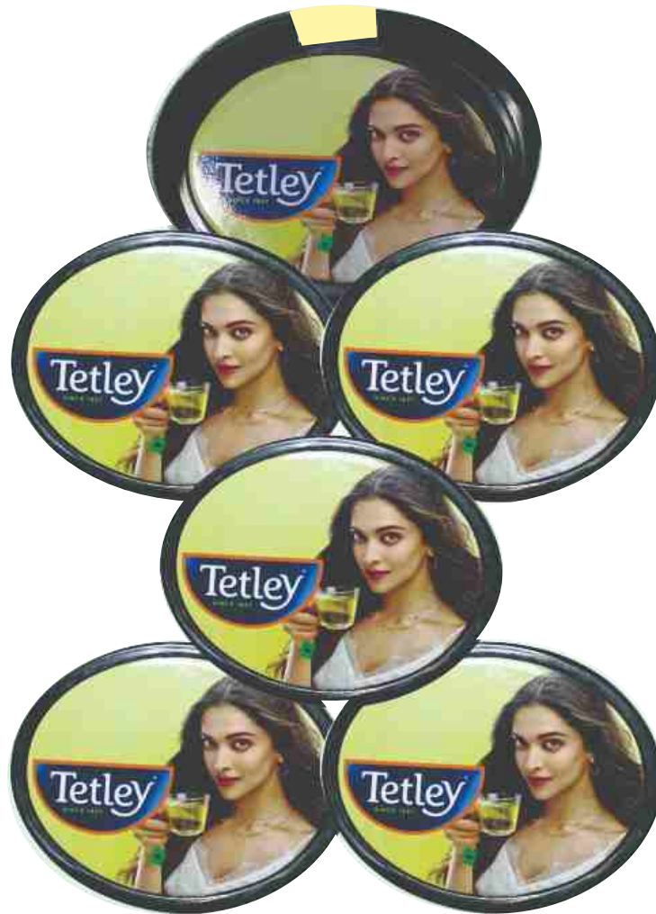
Rs. 42.30 Item No. 12005