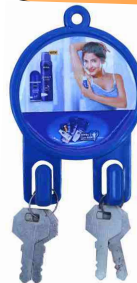
Rs. 7.90 Item No. 12075