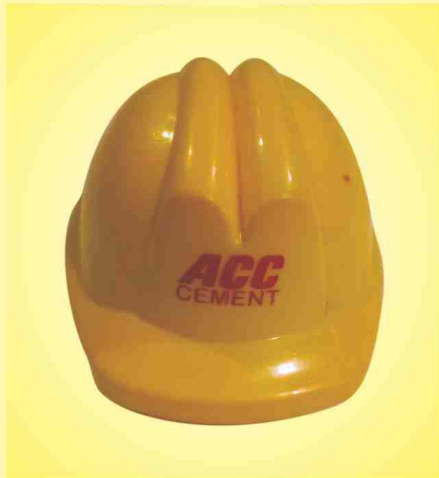
Rs. 21.50 Item No. 12063