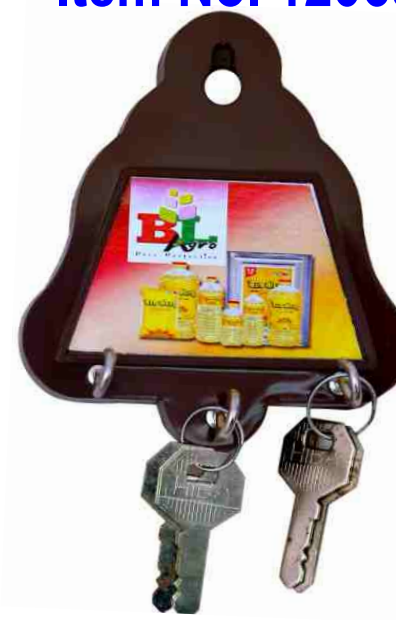
Rs. 17.50 Item No. 12072

For Complete Business Solution VIbc Delhi