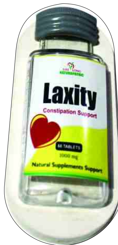
Rs. 19.10 Item No. 12051