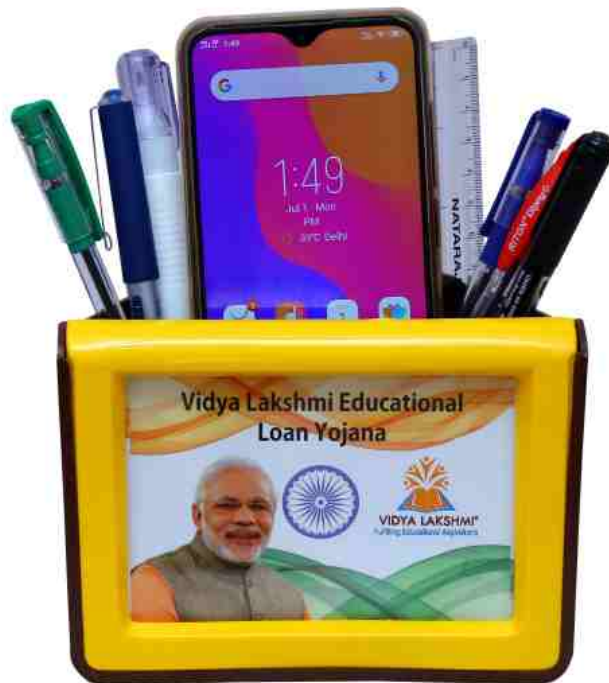
Rs. 56.00 Item No. 12022