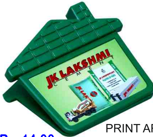
Rs. 14.00 Item No. 12045