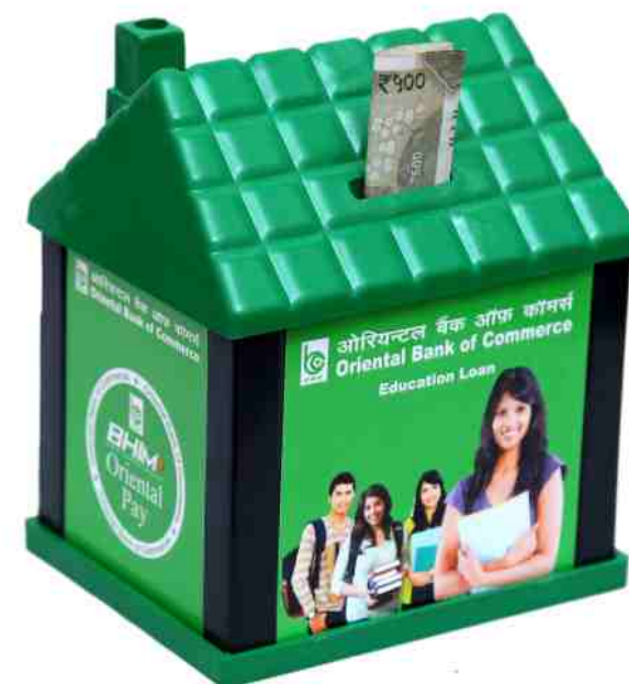
Rs. 69.00 Item No. 12027

PRINT AREA: 75X90 : 100X90 OUTER SIZE : 75X101 : 100X101 PRODUCT SIZE: 110X135=160H