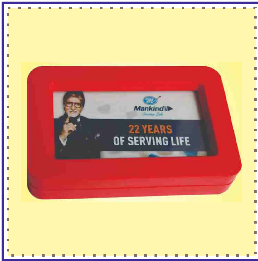
Rs. 16.90 Item No. 12061