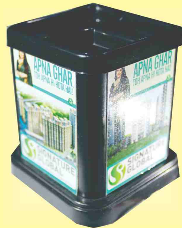
Rs. 24.65 Item No. 12017