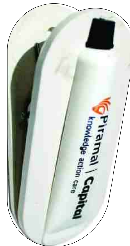
Rs. 7500 Item No. 12052