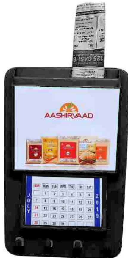
Rs. 73.50 Item No. 12085