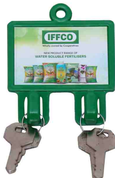
Rs. 7.20 Item No. 12076