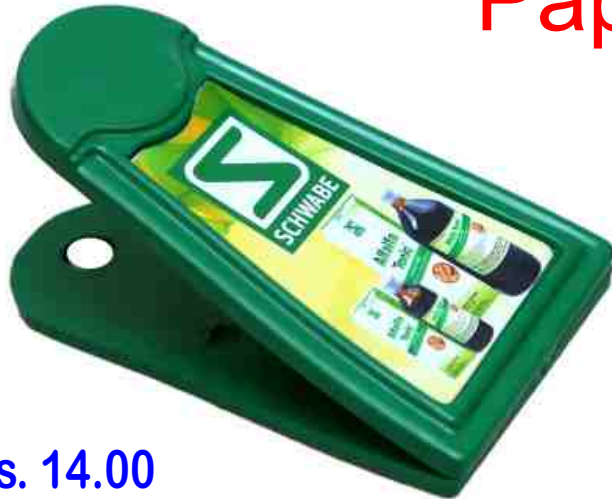
Rs. 14.00 Item No. 12041