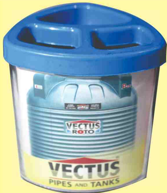
Rs. 35.85 Item No. 12020