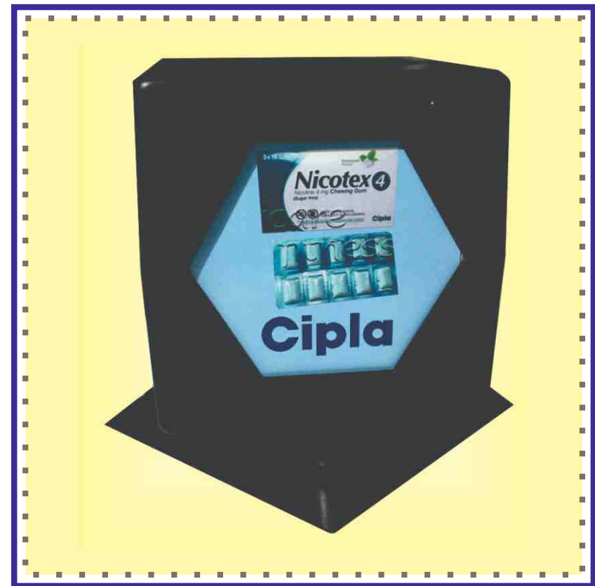
Rs. 53.75 Item No. 12019