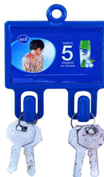
Rs. 7.20 Item No. 12077