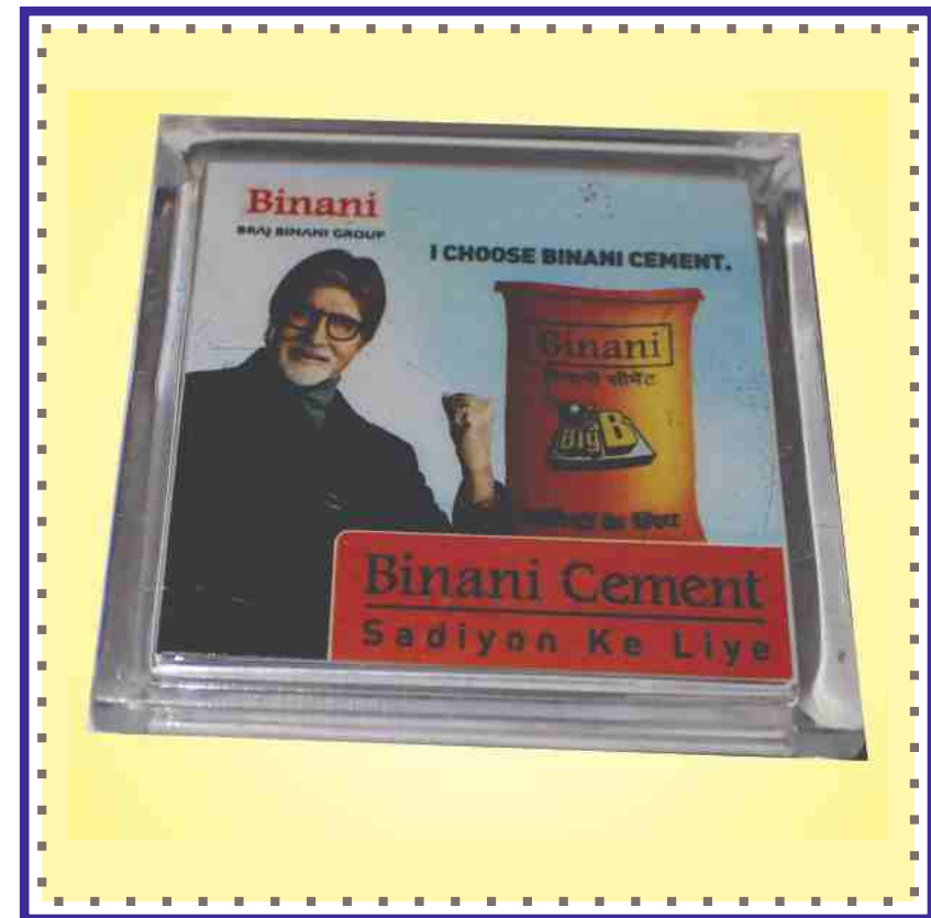
Rs. 30.00 Item No. 12062