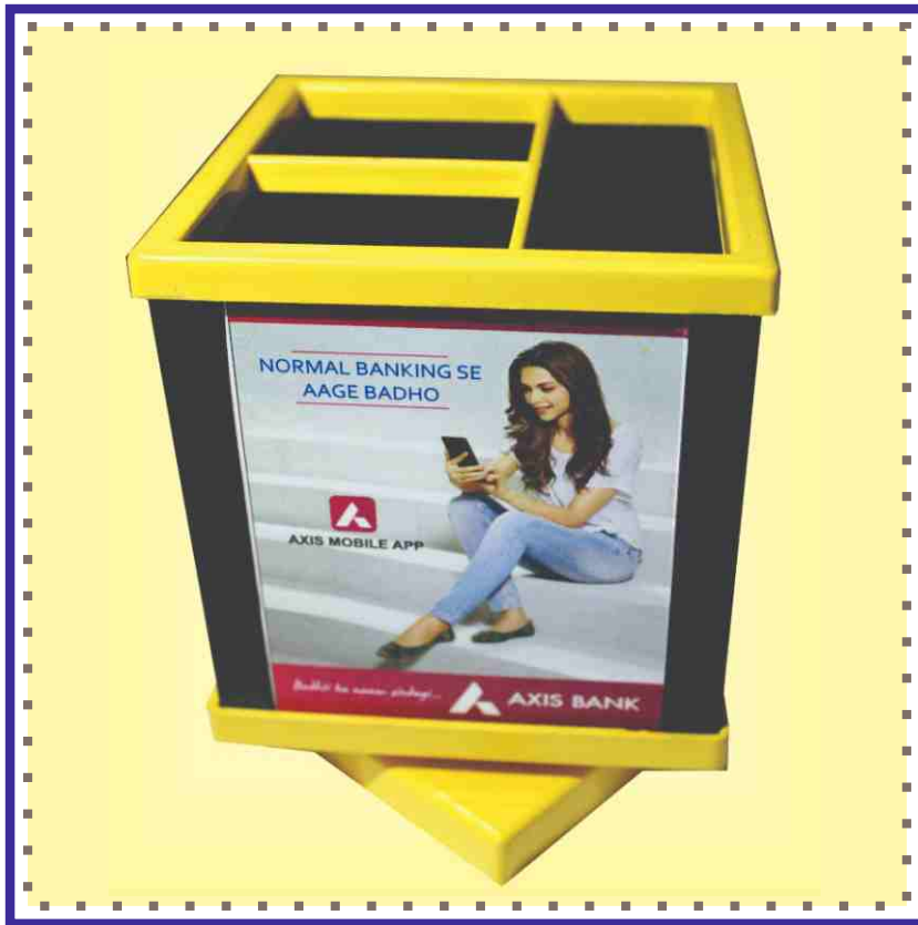
Rs. 56.00 Item No. 12018