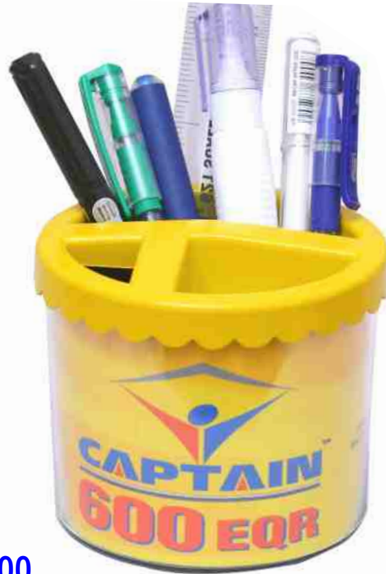
Rs. 45.00 Item No. 120091