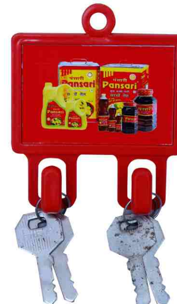
Rs. 7.20 Item No. 12078

For Complete Business Solution VLbc Delhi