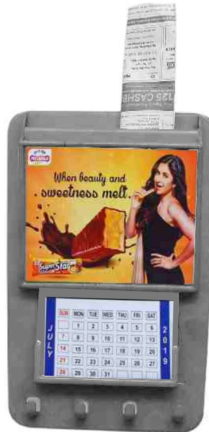
Rs. 73.50 Item No. 12086 PRINT AREA: 117X147 PRODUCT SIZE: 192X192