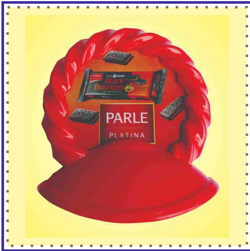
Rs. 15.90 Item No. 12055