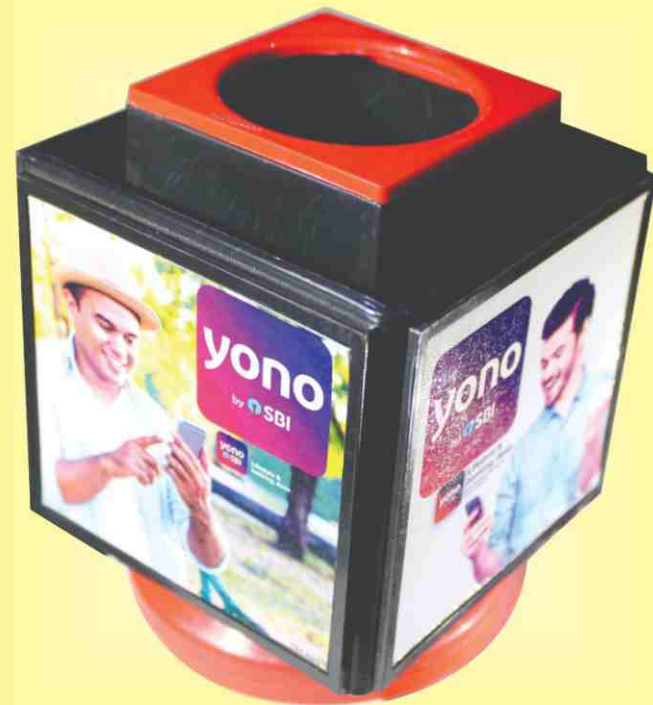
Rs. 72.80 Item No. 12021