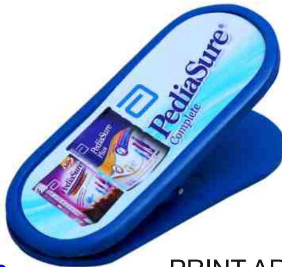
Rs. 14.00 Item No. 12043