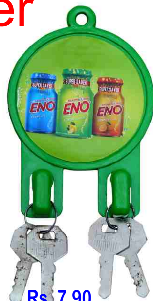
Rs. 7.90 Item No. 12073