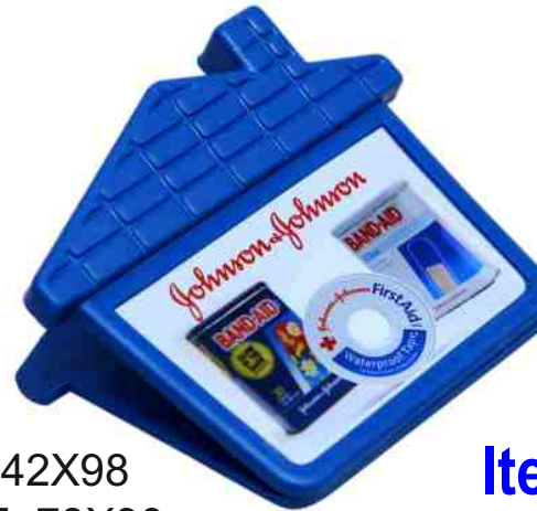
Rs. 14.00 Item No. 12046