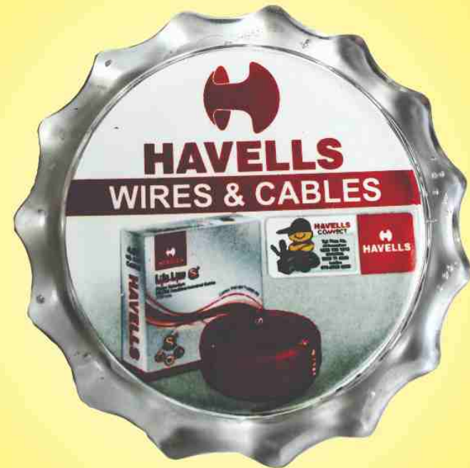
Rs. 28.00 Item No. 12064