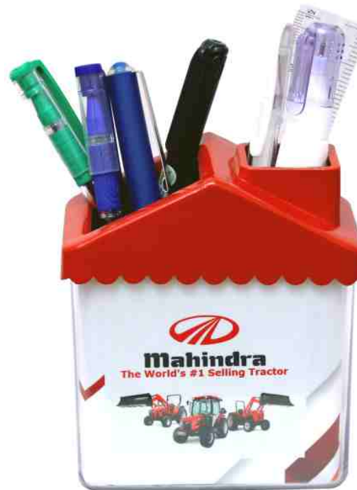
Rs. 47.00 Item No. 12012

PRINT AREA: 70X260 OUTER SIZE : 85X290 PRODUCT SIZE: 60X100=117H