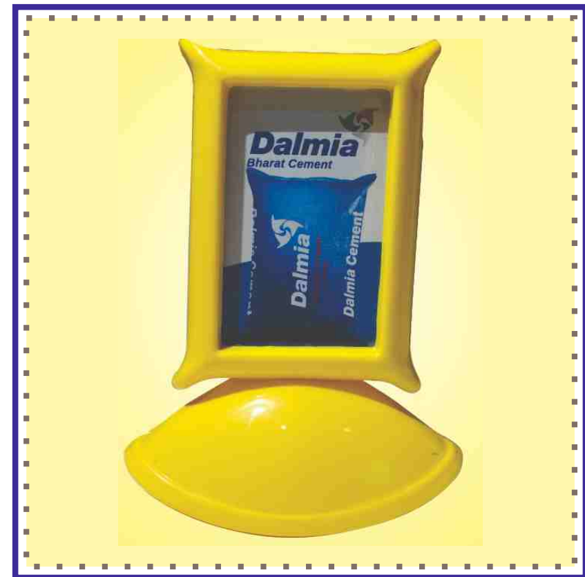
Rs. 16.90 Item No. 12060