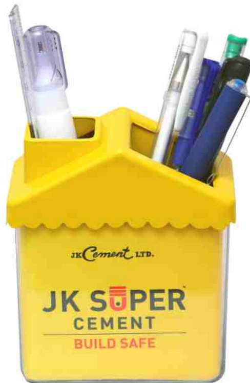
Rs. 47.00 Item No. 12011