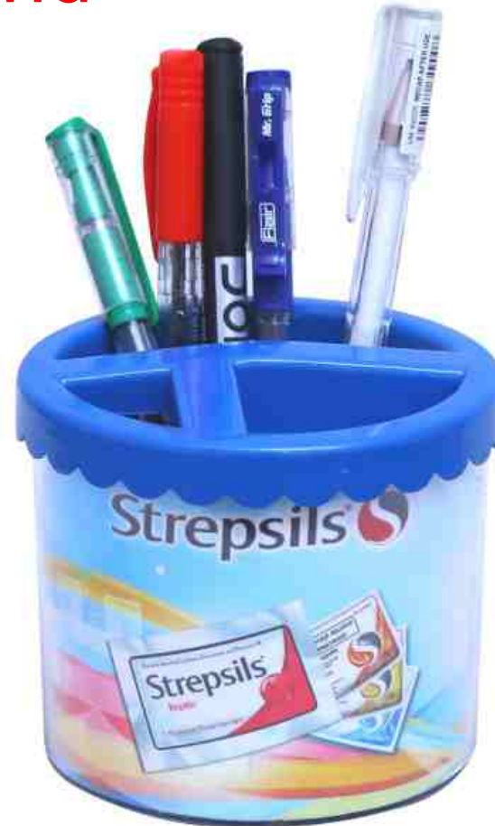
Rs. 45.00 Item No. 12010

PRINT AREA: 60X260 OUTER SIZE : 78X280 PRODUCT SIZE: 101X101=90H