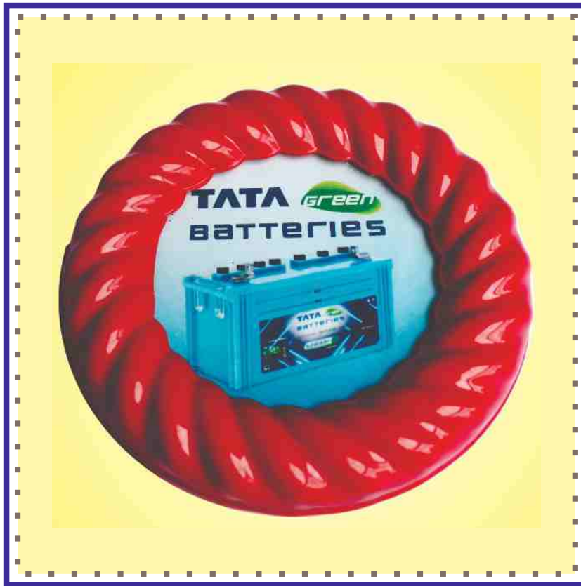
Rs. 15.90 Item No. 12059