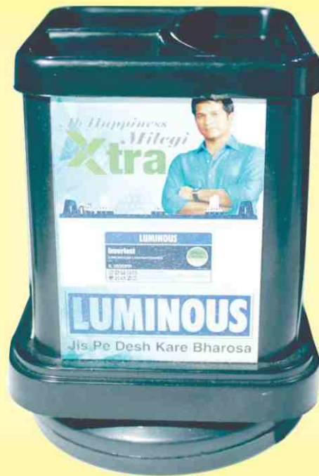
Rs. 30.50 Item No. 12016