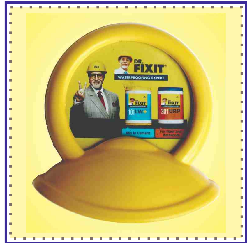
Rs. 15.90 Item No. 12056