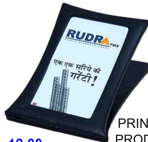
Rs. 12.00 Item No. 12047