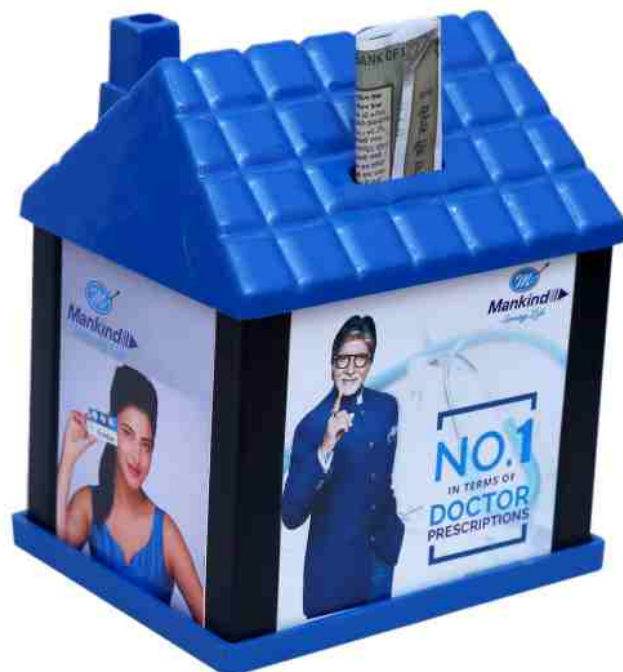
Rs. 69.00 Item No. 12025