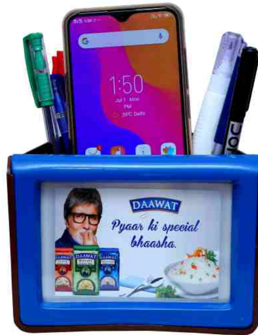
Rs. 56.00 Item No. 12023