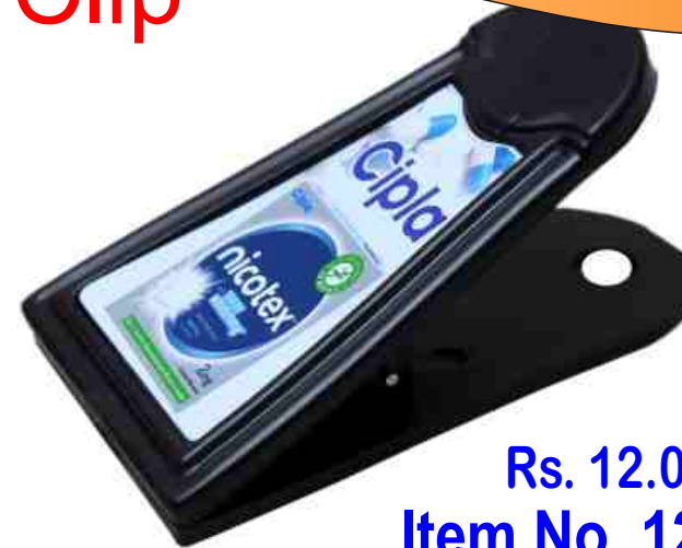
Rs. 12.00 Item No. 12042