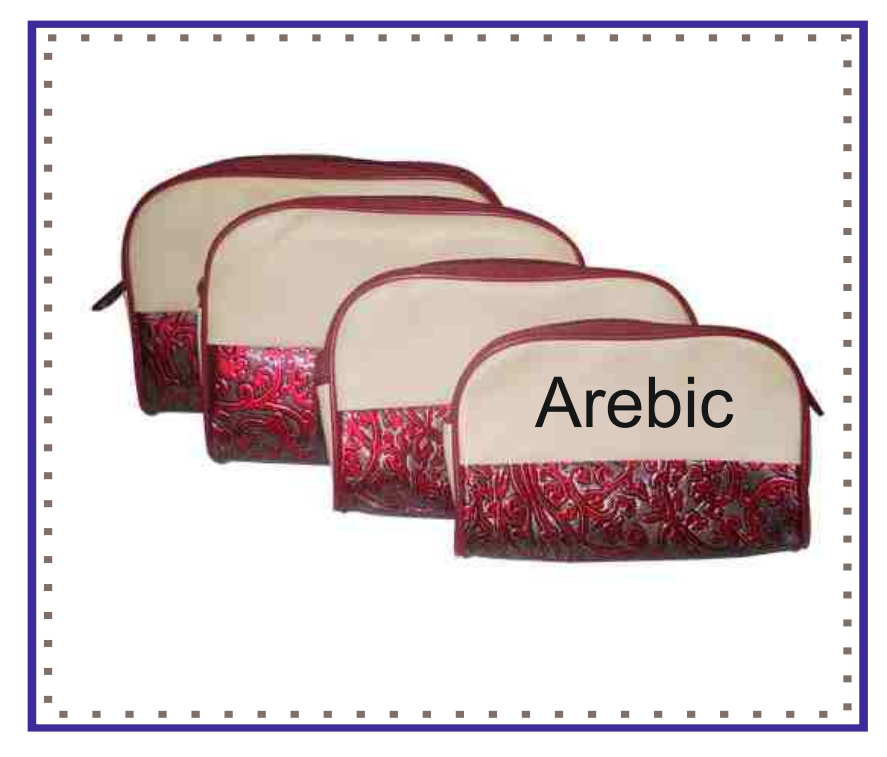
Item no. 8503 @ Rs. 33.50