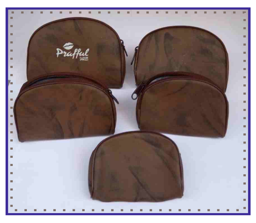
Item no. 8504 @ Rs. 37.00