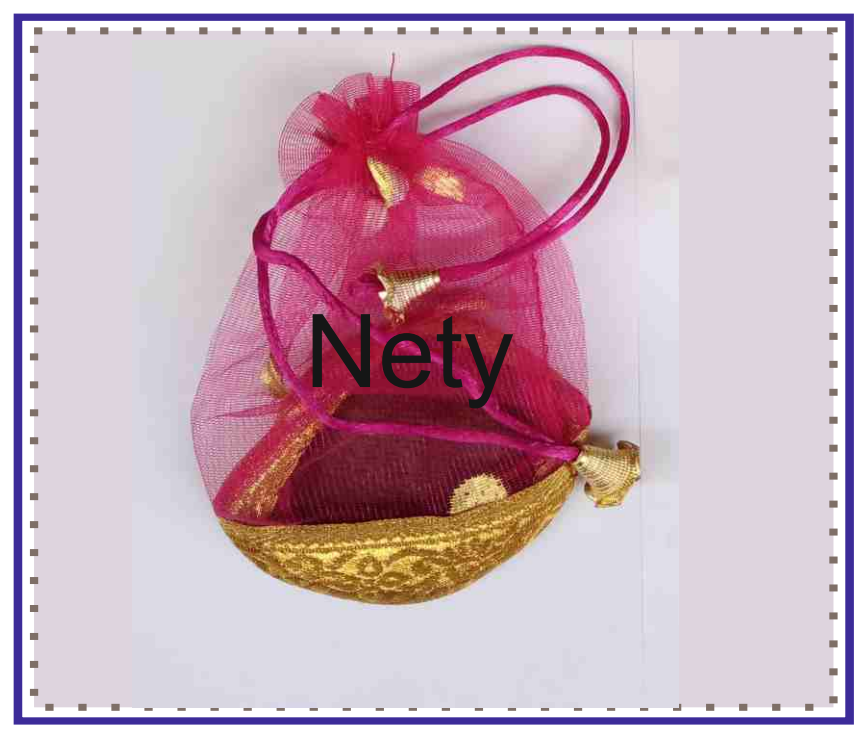
Item no. 8509 @ Rs. 8.30