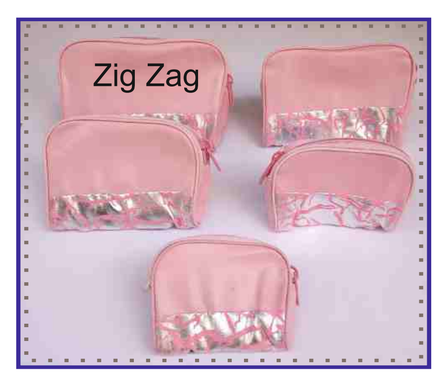
Item no. 8512 @ Rs. 26.00