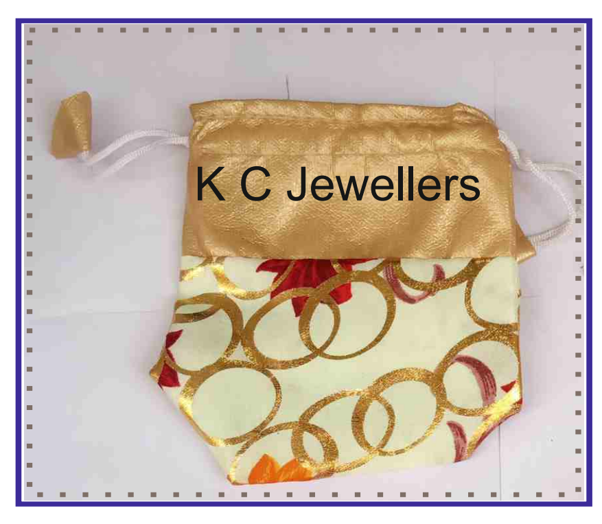
Item no. 8507 @ Rs.11.80