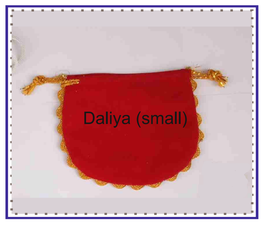
Item no. 8508 @ Rs. 4.20