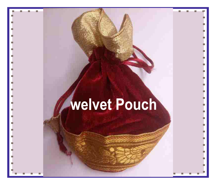
Item no. 8511 @ Rs. 11.00