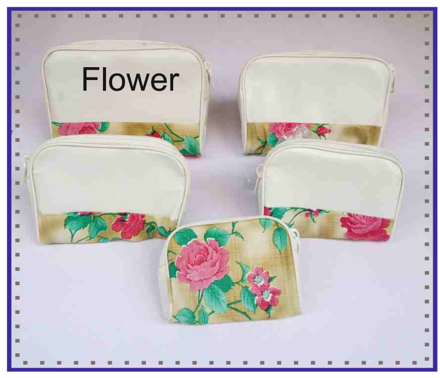
Item no. 8505 @ Rs. 30.00