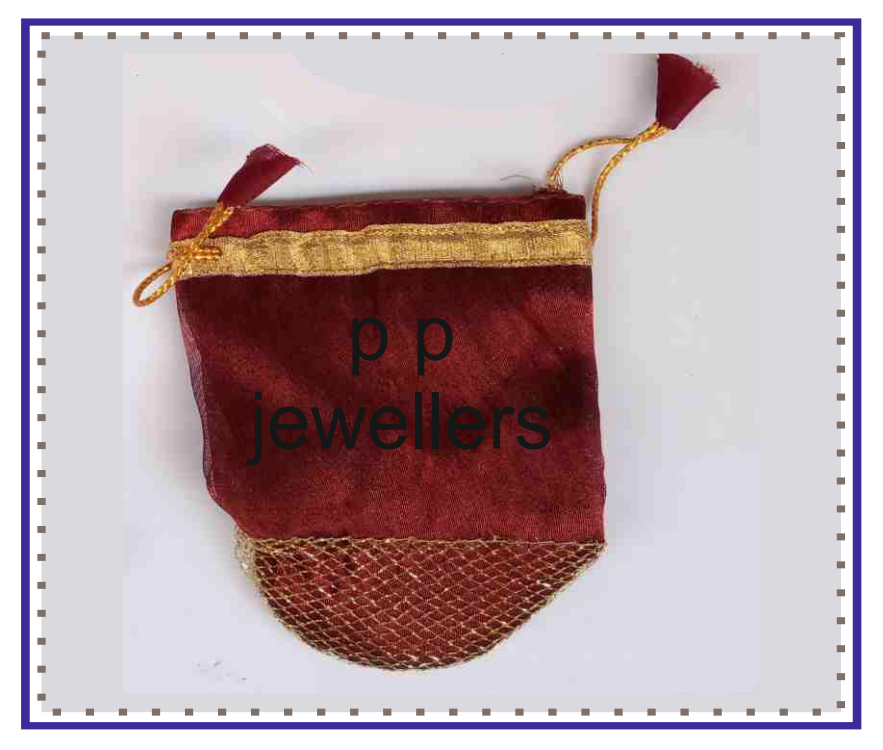
Item no. 8510 @ Rs. 9.60