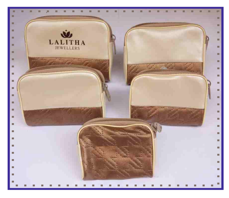
Item no. 8501 @ Rs. 37.00