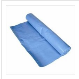
Blue Polythene Sheets