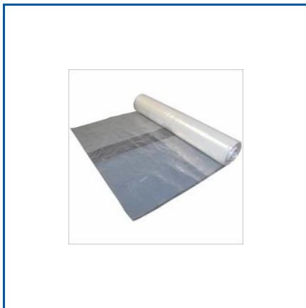
TRANSPARENT POLYTHENE SHEETS

Agricultural Irrigation Pipes, Agriculture HDPE Sheets, Black Garbage Bags, Black Polythene Sheets, Black Polythene Tube, Blue Polythene Sheets, Construction Polythene Sheets, Gas Extraction HDPE Sheets, HDPE Laminated Tarpaulin, HDPE Plastic Dana, HDPE Plastic Granules, HDPE Plastic Sheets, HDPE Plastic Tarpaulin, HDPE Polythene Sheets, HDPE Sheets (Road Lining), etc.