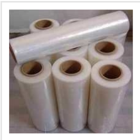
LDPE Plastic Sheet Rolls