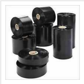
Black Polythene Tube