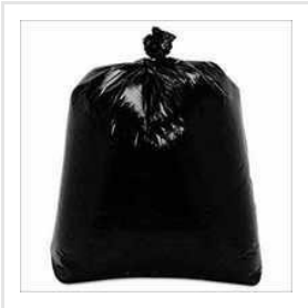
Black Garbage Bags