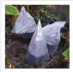
Nursery Plastic Bags