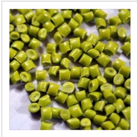
HDPE Plastic Granules