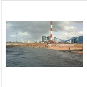
Industrial LDPE Sheets