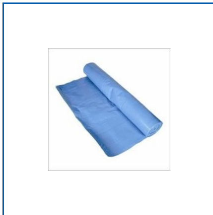
CONSTRUCTION POLYTHENE SHEETS