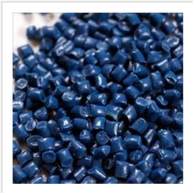
HDPE Plastic Dana