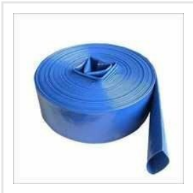
LDPE Flat Pipes