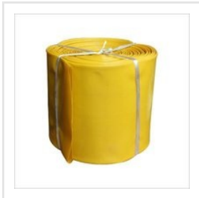
LDPE Kisan Pipes