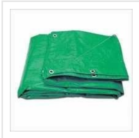
HDPE Plastic Tarpaulin