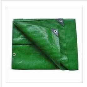
HDPE Laminated Tarpaulin