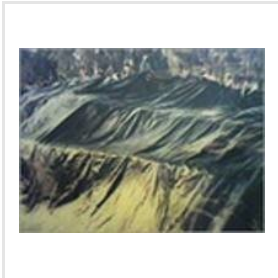
Wide Width LDPE Poly Sheet