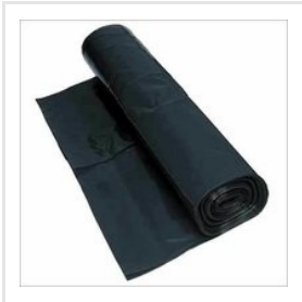
Roofing Polythene Sheets