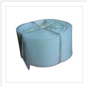
LDPE Irrigation Pipes