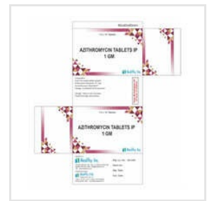
1gm Azithromycin Tablets IP