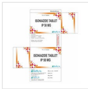
50mg Isoniazide Tablets