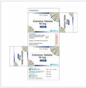
10mg Cetrizine Tablets