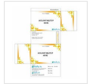
400mg Aciclovir Tablets IP