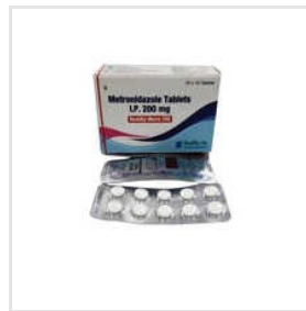
200mg Metronidazole Tablets IP