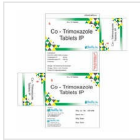
Co-Trimoxazole Tablets IP