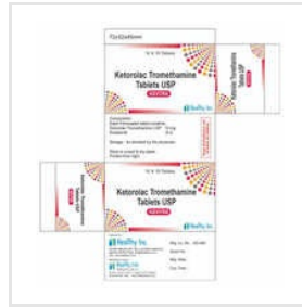
Ketorolac Tromethamine Tablets