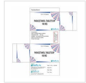
100mg Paracetamol Tablets BP