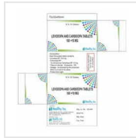
100mg Levodopa and 10mg Carbidopa