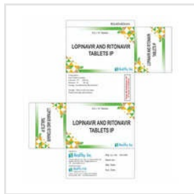
Lopinavir and Ritonavir Tablets IP