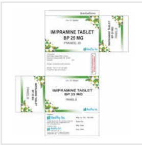
25mg Imipramine Tablets BP