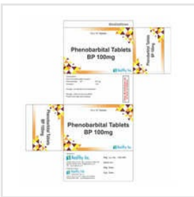
100mg Phenobarbital Tablets BP