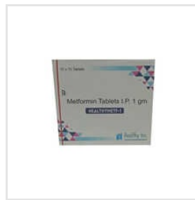
1gm Metformin Tablets IP