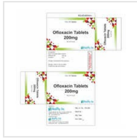
200mg Ofloxacin Tablets