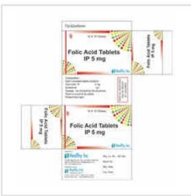
5mg Folic Acid Tablets IP