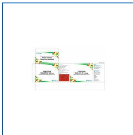
2.5MG PRAZOSIN TABLETS IP