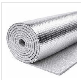
20 MM Bubble Insulation Roll