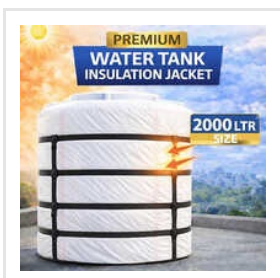
2000 Ltr Insulation Jacket Water Tank