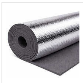
13 MM XLPE Foam Insulation Sheet Foil