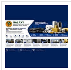
Nitrile Rubber Insulation