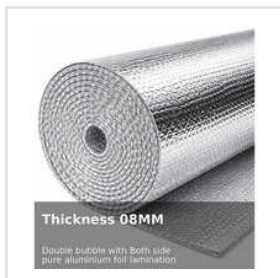
8 MM Bubble Insulation Aluminium Foil Roll