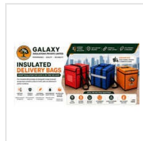
Insulated Delivery Bags