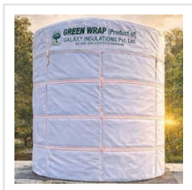
Water Tank Insulation Cover