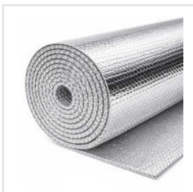
12 MM Bubble Insulation Roll