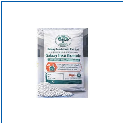
ROOF INSULATION GRANULES

1000 Ltr Insulation Jacket Water Tank, 12 MM Bubble Insulation Roll Aluminium Foil, 13 MM XLPE Foam Insulation Sheet Foil, 1500 Ltr Insulation Jacket Water Tank, 16 MM Bubble Insulation Roll Aluminium Foil, 19 MM XLPE Foam Insulation Sheet Foil, 20 MM Bubble Insulation Roll Aluminium Foil jpg, 2000 Ltr Insulation Jacket Water Tank, 25 MM XLPE Foam Insulation Sheet Foil, 500 Ltr Insulation Jacket Water Tank, 6 MM XLPE Foam Insulation Sheet Foil, 750 Ltr Insulation Jacket Water Tank, 8 MM Bubble Insulation Aluminium Foil Roll, 9 MM XLPE Foam Insulation Sheet Foil, Insulated Delivery Bags, etc.