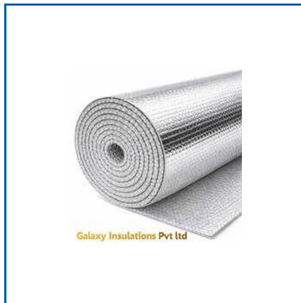
16 MM BUBBLE INSULATION ROLL ALUMINIUM FOIL