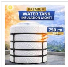
750 Ltr Insulation Jacket Water Tank