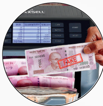
6 Fold Counterfeit Detection Technology