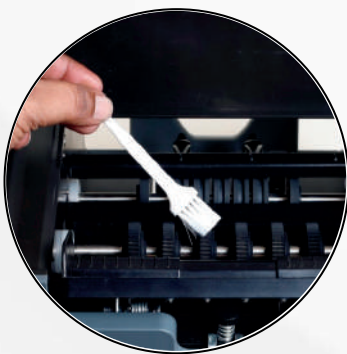
Easy-to-clean inner parts with Top Opening Cover