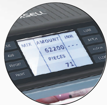
3" Full TFT Colour Display for better viewing experience