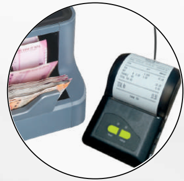
Counting results can be printed instantly on external printer (Printer optional)