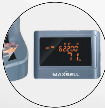
LED Auxiliary Display Included (FREE)