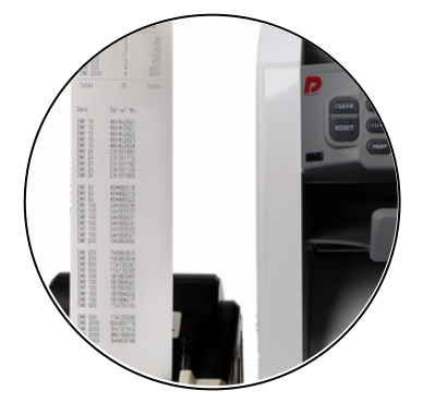
Banknotes serial number reading & printing system (OCR Based)