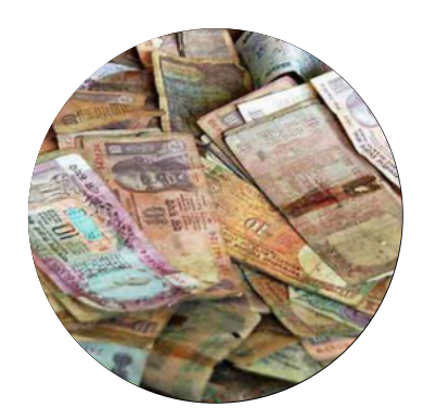
Full fitness function Detects all unfit quality of Banknotes