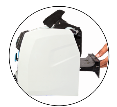
Design of open-channel transport path for easy maintenance & removal of jam notes