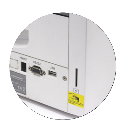
Easy to upgrade new currency software via SD Card