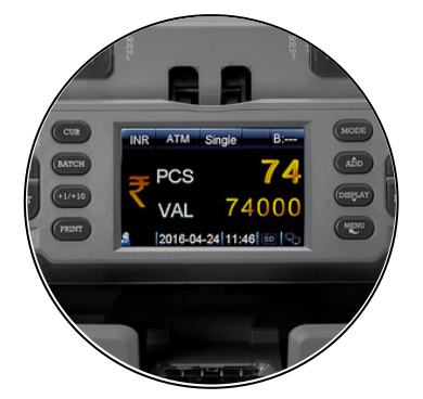
3.5" Full TFT Display with Touch Screen