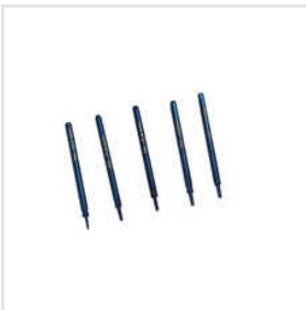
0.7 To 1.2 Mm Hair Transplant Titanium