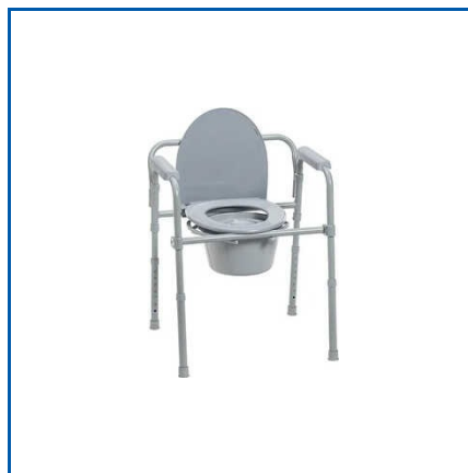
PLASTIC COMMODE CHAIR