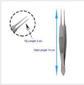
Hair Transplant Stainless Steel Forceps