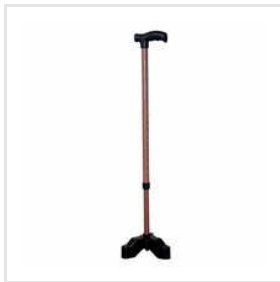
Tripod 3 Leg Walking Stick