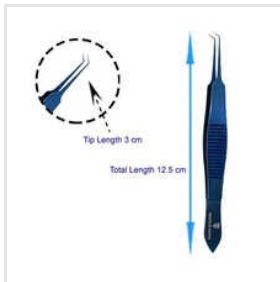
12.5 5 Cm Hair Transplant Titanium