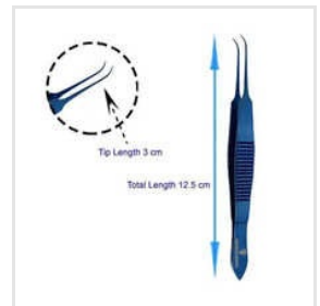
Hair Transplant Titanium Forceps