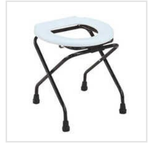
Folding Commode Stool Chair