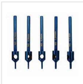
Titanium Hair Transplant Fue