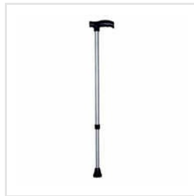
Silver Walking Stick