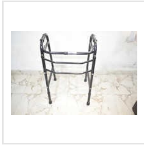
Adjustable Folding Walker Nut Bolt Walker