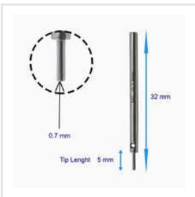
Hair Transplant Titanium FUE 0.7mm