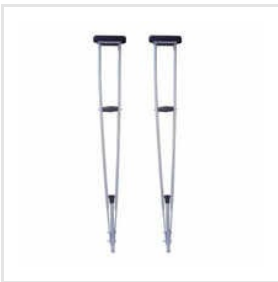
Metal Under Arm Crutches