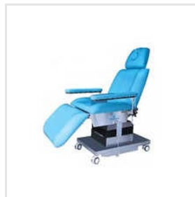
MIDC 10000 Derma Bed Hair Transplant Chair