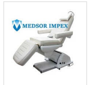
MIDC 1000 Derma Bed Hair Transplant Chair