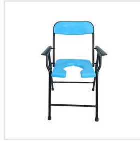
Comfort Premium Folding Commode