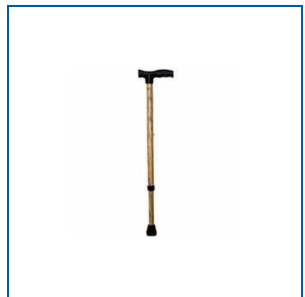
WOODEN WALKING STICK