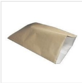
HDPE Laminated Paper Bag - Center Sealed