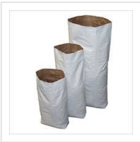
Multiwall Pasted Bag