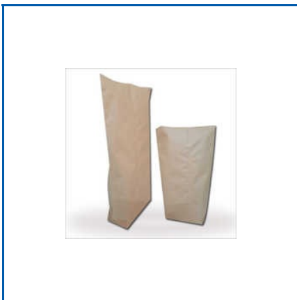
LAMINATED CENTER SEALED PASTED BAG

Customized Paper Bag, Customized Paper Carry Bag, HDPE Laminated Paper Bag – Center Sealed, Handmade Paper Bag, L-Stitched Bag, Laminated Center Sealed Pasted Bag, Laminated Center Sealed Swen Bag, Laminated Center Sealed Valve Bag, Laminated L-Stitched Bag, Multiwall Pasted Bag, Multiwall Pinched Bottom Bag, Multiwall Swen Paper Bag, Multiwall Valve Bag, Paper – Grocery Bag, Paper Bag, etc.