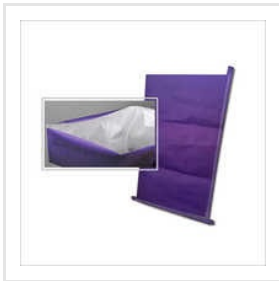
Laminated L-Stitched Bag