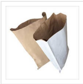
Multiwall Swen Paper Bag