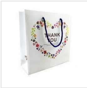
Paper Carry Bag