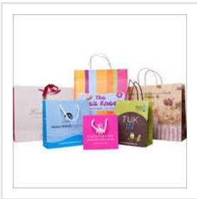
Printed Paper Carry Bag