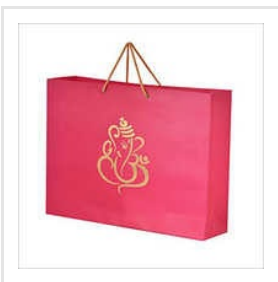
Retail Carry - Shopping Bag