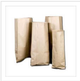
Multiwall Pinched Bottom Bag