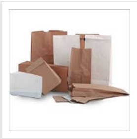
Customized Paper Bag