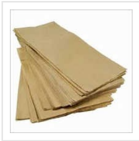
Handmade Paper Bag