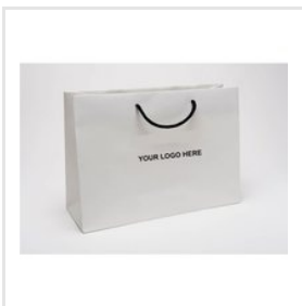
Customized Paper Carry Bag