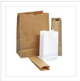
Paper - Grocery Bag