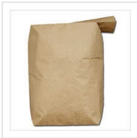
Multiwall Valve Bag