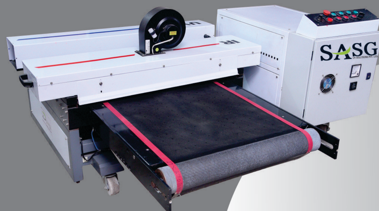
Illustration / Specifications are not binding and subject to change without notice due to our continuous R&D effort for improvement / modifications.

LED UV SYSTEMS | INTERDECK SYSTEMS | SCREEN PRINTING MACHINES | UV CONVEYOR | ANILOX COATER