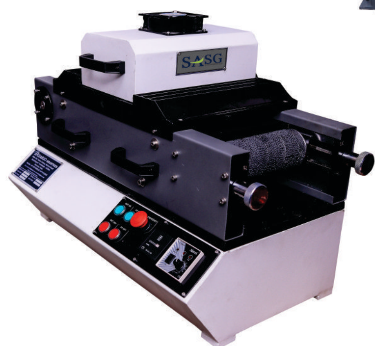
Table Top- Mini UV CURING SYSTEM

Table top machines are manufacturing in strict technical specifications and offer compact design for easy mobility and installation. These are also fitted with a heat resistant mesh conveyor belt to reduce the heat transfer.