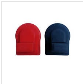
Red And Black Battery Terminal Protector