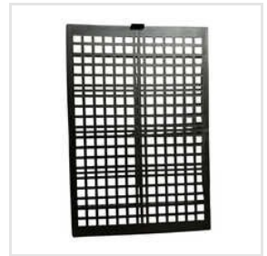
240x163x18.5mm Battery Side Packing