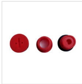
22x2mm Vent Plug