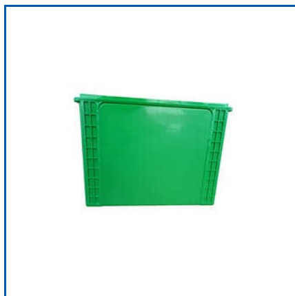
410X204X172 N100 BATTERY CONTAINER