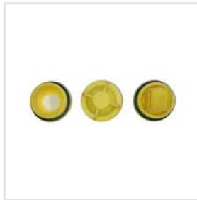
30x2mm Vent Plug