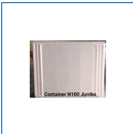
N100 JUMBO BATTERY CONTAINER

170x50x1.5mm Battery Separator, 170x70x25mm Plastic Battery Madrest Flap, 210x168x11.2mm Battery Side Packing, 22x2mm Vent Plug, 240x163x18.5mm Battery Side Packing, 30x2mm Vent Plug, 410x204x172 N100 Battery Container, Laxmi Yantra, N100 Jumbo Battery Container, Red And Black Battery Terminal Protector, etc.