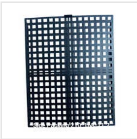
210x168x11.2mm Battery Side Packing