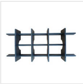
170x70x25mm Plastic Battery Madrest Flap