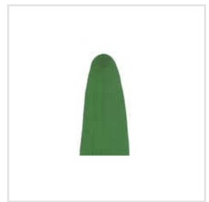
Green Fruity Shed Pigment Paste