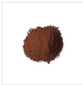
Brown Oxide Pigment