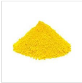
82 Solvent Suitable Yellow Dyes