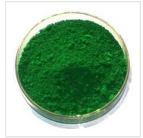
Dark Green Synthetic Oxide Pigment