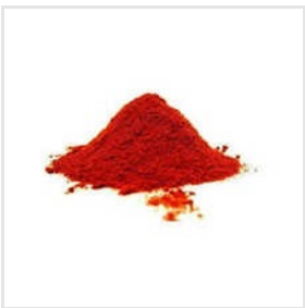
8 Solvent Suitable Red Dyes