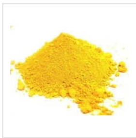
Yellow Oxide Pigment