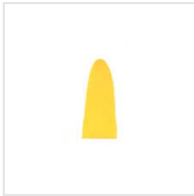
Yellow Pigment Paste