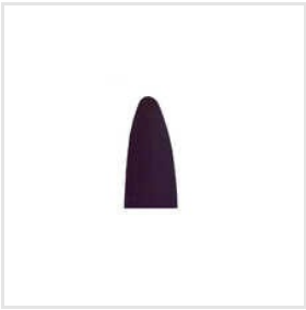
Violet Pigment Paste