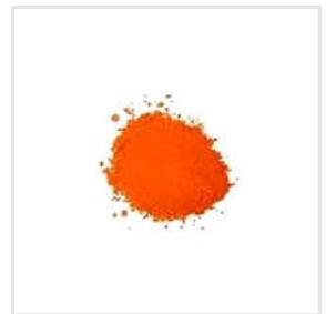
58 Orange Solvent Suitable Dyes