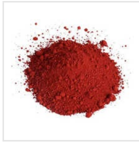
Red Oxide Pigment