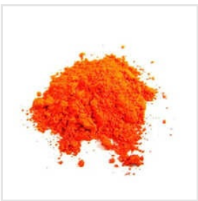
Orange Iron Oxide Pigment