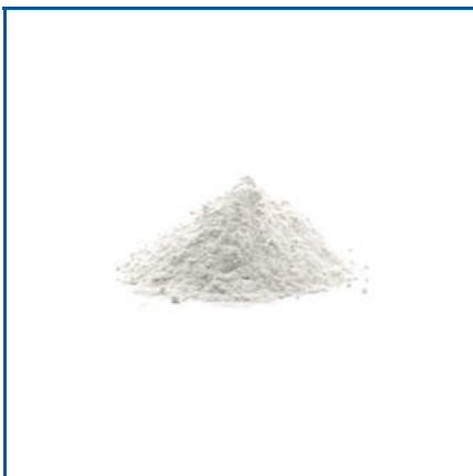
SUPERCHLONE 803 MWS JAPAN CHLORINATED POLY PROPRELYN RESINE

(UN 1193), 13 Pigment Yellow, 25 kg CP 450 Hanwha PVC Resin, 45 Brown Solvent Suitable Dyes, 58 Orange Solvent Suitable Dyes, 8 Solvent Suitable Red Dyes, 82 Solvent Suitable Yellow Dyes, Af 32 Wax, Anhydrous Sodium Dichromate, Beta Blue 15.3 Pigment Paste, Black 46 Solvent Suitable Dyes, Black 7 Nigrosine Oil Soluble Solvent, Black Iron Oxide Pigment, Brown 48 Solvent Suitable Dyes, Brown Oxide Pigment, etc.