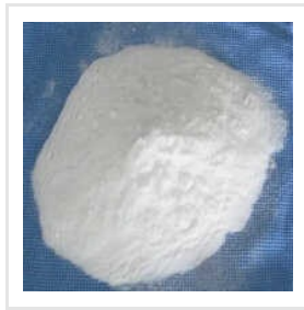
EVA Base Vinyl Copolymer Resin