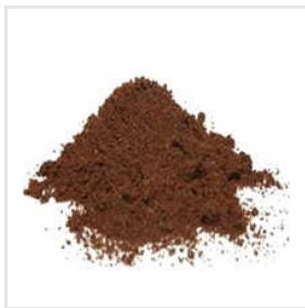
45 Brown Solvent Suitable Dyes