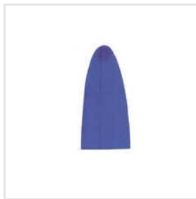
Beta Blue 15.3 Pigment Paste