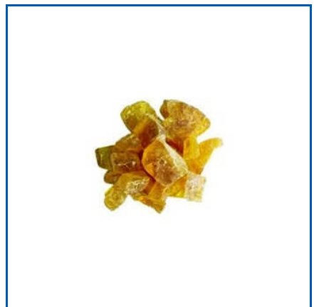
PURE PHENOLIC RESIN FOR DEEP FREGING INKS