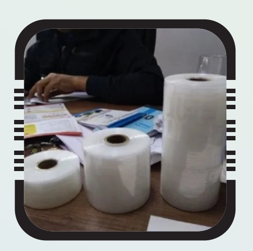
Polyethylene Stretch Film