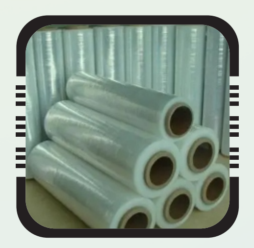
Stretch Wrapping Films