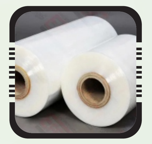
Stretch Poly Film