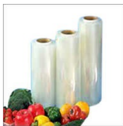
FOOD GRADE STRETCH FILM