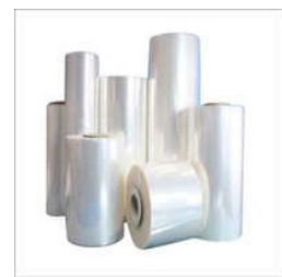
BABY CORE STRETCH FILM