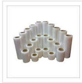
Manual Grade Stretch Film