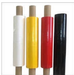
COLORED STRETCH FILM

Baby Core Stretch Film, Colored Stretch Film, Food Grade Stretch Film, Machine Grade Stretch Film, Manual Grade Stretch Film, Packing Stretch Film, Stretch Wrap Film, Transparent PRE Stretch Film, Transparent Stretch Film, etc.