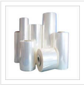
Baby Core Stretch Film