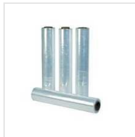
Transparent PRE Stretch Film