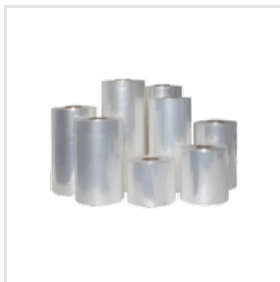
Packing Stretch Film