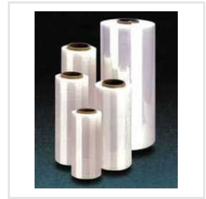
Stretch Wrap Film