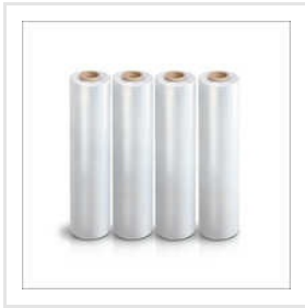
Transparent PRE Stretch Film