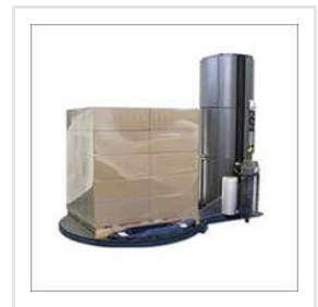
Machine Grade Stretch Film