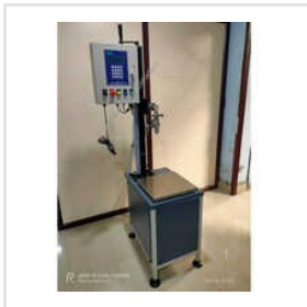
Automatic Bottle Oil Jar Can Filling Machine