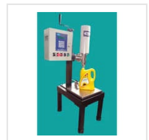
Automatic Edible Oil Bottle Filling Machine