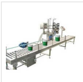
Paint Bucket Filling Machine