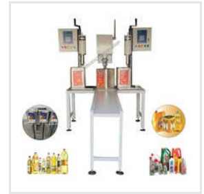
Automatic Double Head Liquid Filling