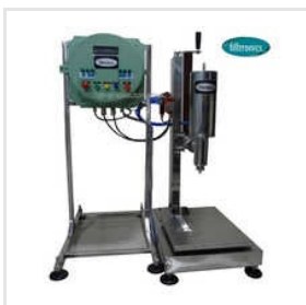
Automatic Flame Proof Filling Machine