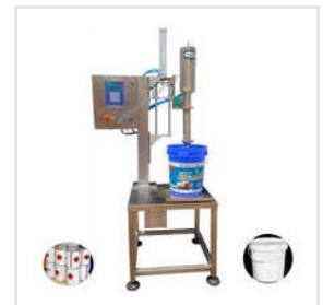
Automatic Bucket Filling Machine