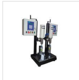
Double Head Bottle Filling Machines