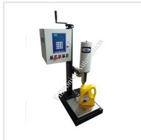
Ghee Filling Machine