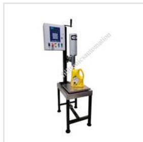
Lubricant Filling Machine