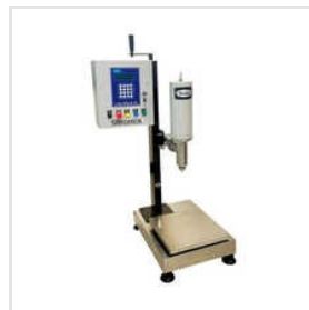
Automatic Liquid Filling Machine