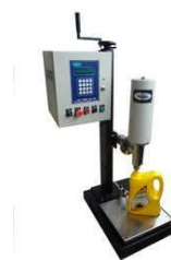
SINGLE HEAD LIQUID FILLING MACHINE