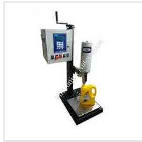
Semi Automatic Edible Oil Filling Machine