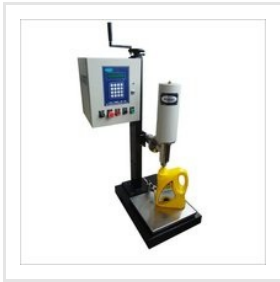
Container Filling Machine