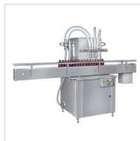
Automatic Glass Bottle Filling Machine