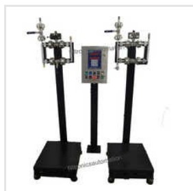
CO2 Gas Filling Machine