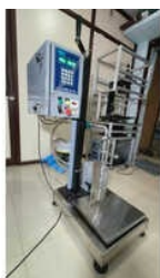
SEMI AUTOMATIC BOTTLE FILLING MACHINE

Adblue And DEF Filling Machine, Adblue Filling Machine, Automatic Adblue Filling Machine, Automatic Auger Type Bottle Filling Machine, Automatic Bag Filling Machine, Automatic Bagging Machine, Automatic Bottle Capping Machine, Automatic Bottle Oil Jar Can Filling machine Without Air, Automatic Bucket Filling Machine, etc.