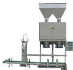
GRANULE BAG FILLING MACHINE