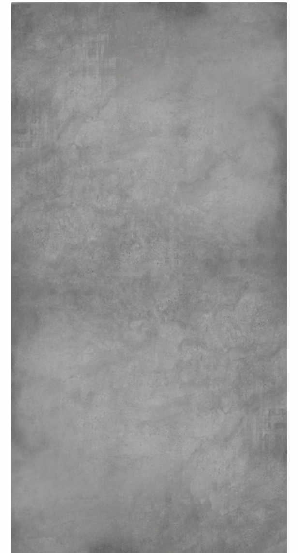
Cyprus Dark Grey

Glazed Vitrified Tiles 600x1200mm | Rustic Finish